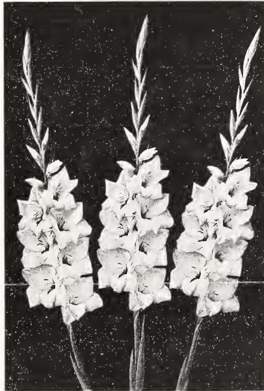
The Lily Supreme---The Gladiolus

Consider the lilies of the field how they grow; They toil not, neither do they spin; And yet I say unto you That even Solomon in all his glory was not arrayed like one of these. ---Holy Scripture