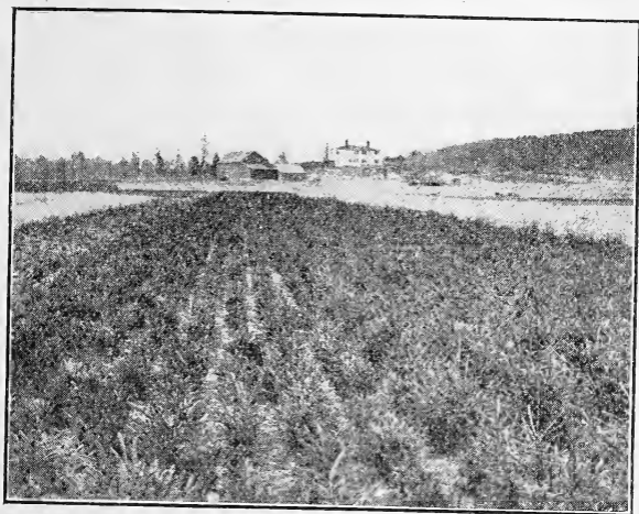
NURSERY BLOCK OF NORWAY SPRUCE

Our nurseries are three in number, all located in Massachusetts, as follows: