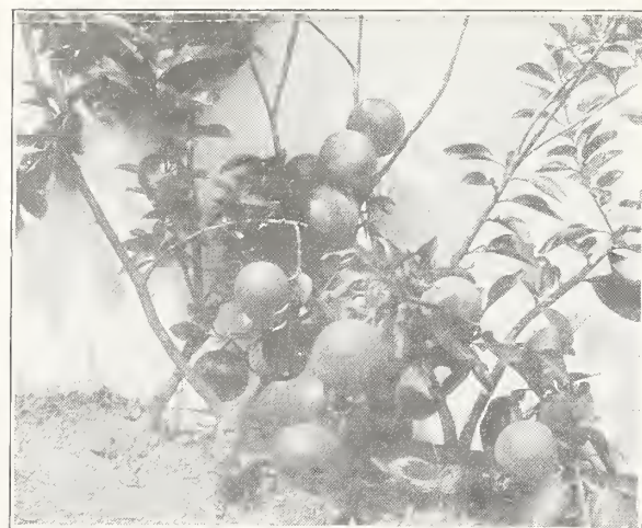
This picture shows Duncan Grapefruit trees bearing in our Nursery rows, 3 years after they are budded.

NURSERY REFERENCES: Citizens Savings Bank and Magnolia Bank, Magnolia, Mississippi.