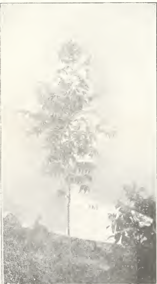
Showing a six foot Grafted Pecan Tree in one of our Nursery rows.