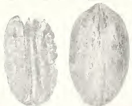
Stuart Pecan - Natural Size

IF YOU WISH the bounty of peace and plenty when you are older, plant our trees now.