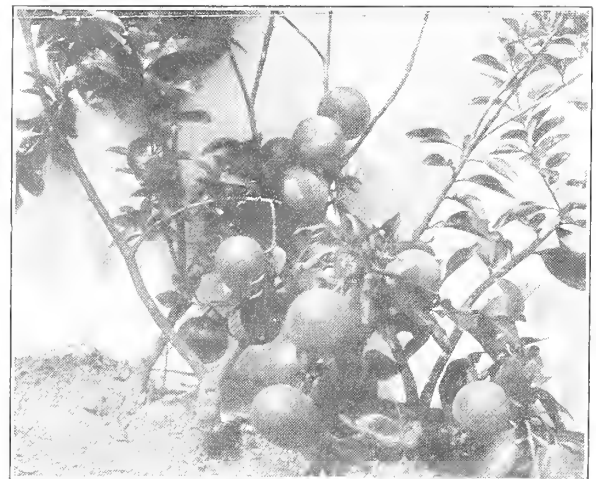
This picture shows Duncan Grapefruit trees bearing in our Nursery rows, 3 years after they are budded.

NURSERY REFERENCES: Citizens Savings Bank and Magnolia Bank, Magnolia, Mississippi.