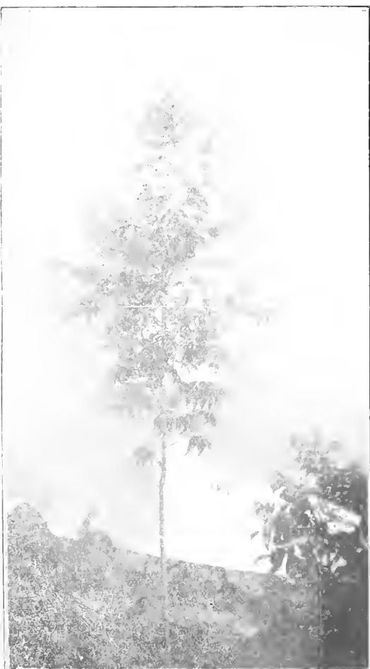
Showing a six foot Grafted Pecan Tree in one of our Nursery rows.