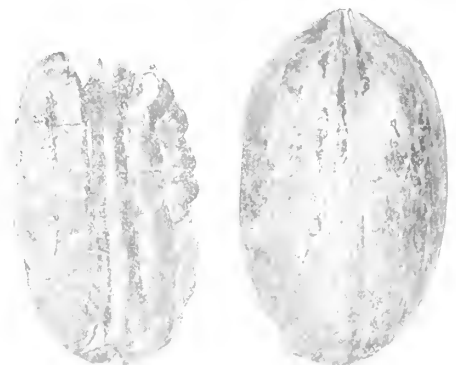
Stuart Pecan - Natural Size

IF YOU WISH the bounty of peace and plenty when you are older, plant our trees now.