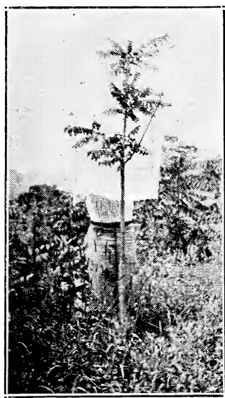
This is a 7- to 8-foot Thomas tree cut back to about 6 feet. Although planted the first of June it is making an excellent growth. Please notice the height at which it is branching out and calculate the number of years it will take the 2-foot Thomas in No. 1 to attain this height