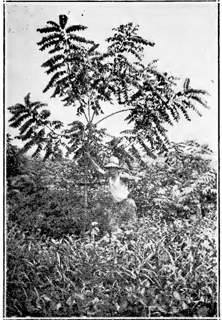
A 5-year-old Thomas in my test orchard. This was a 2-foot tree when set. It has made remarkable growth but due to using nearly four years in getting it up the head is only about one year old, hence no bearing. If a 6-foot tree had been set a larger and older head would be had and possibly bearing