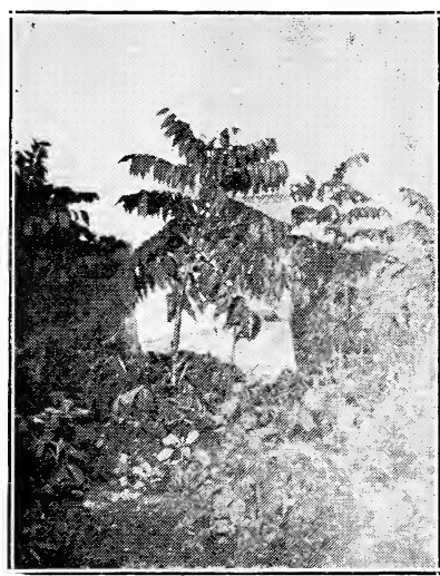
A 2-foot Thomas black walnut making its second-year growth, now about 3 1/2 feet. It is growing very rapidly and would please any planter. But it will take a third year's growth to get it high enough to be permitted to head out. Note No. 2 cut