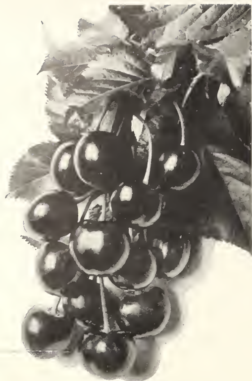
Black Tartarian Cherries