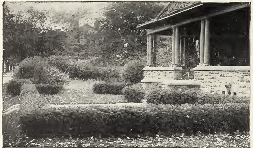
Hedge of Barberry Thunbergii