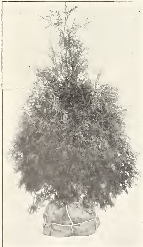
Evergreen Ready for Shipment

California Privet—Best trimmed hedge 3 to 5 ft. high. Set in single row 10 inches apart. If broad hedge is desired plant in double rows—rows 1 foot apart and bushes 1 foot apart in each row, but staggered so as to come 6 inches apart in hedge. Strong bushes, 18 to 24 in. high, 70c per 10, $4.00 per 100, $35.00 per 1000. Extra strong bushes, 2 to 3 ft. high, $1.00 per 10, $5.00 per 100, $45.00 per 1000.