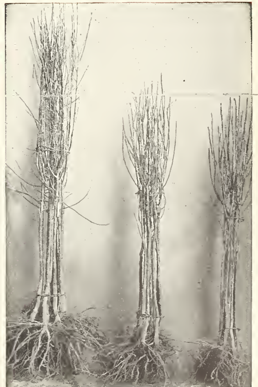
XXX 5 to 7 ft. XX 4 to 5 ft. X 3 to 4 ft. 3/4 and up 5/8 to 3/4 1/2 to 5/8