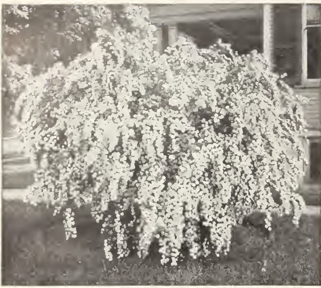
Spiraea Van Houttei in Full Bloom

Weigela Eva Rathke—Rich, deep scarlet blossoms in June. 2½ to 3 ft., 45c each.