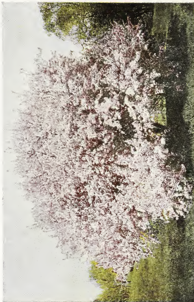
JAPANESE FLOWERING CRAB ( Malus floribunda )