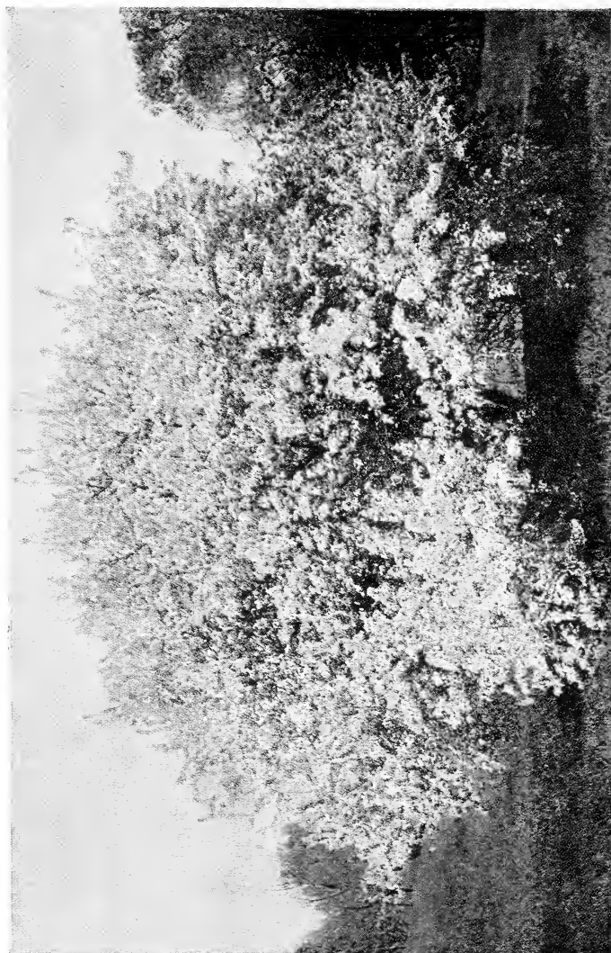
JAPANESE FLOWERING CRAB ( Malus floribunda )