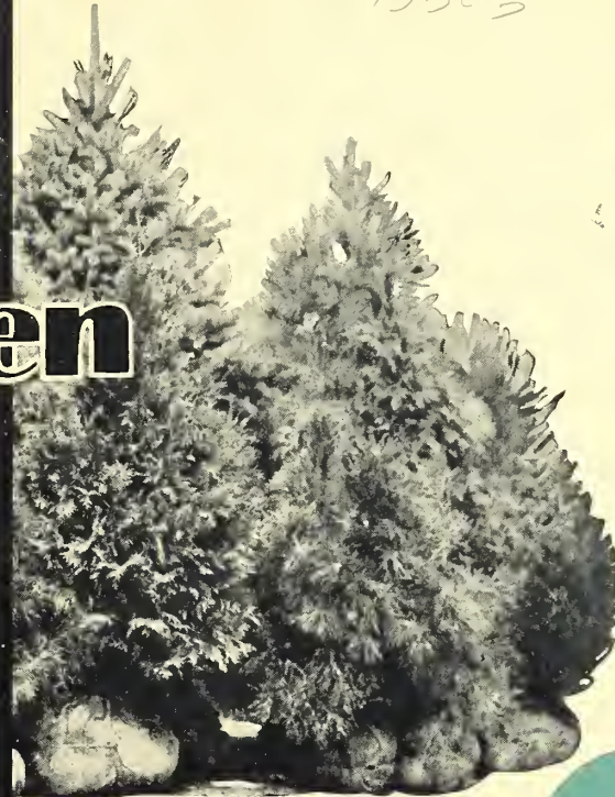
Return postage guaranteed Little Tree Farms, Framingham Centre, Mass.