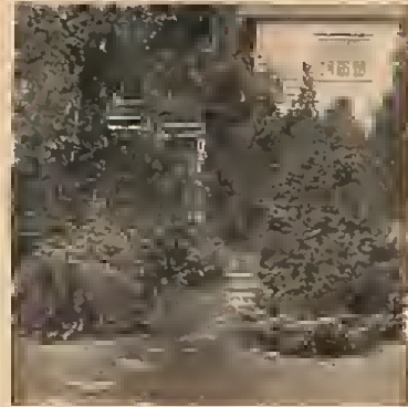
Plant Evergreens along paths and drives.