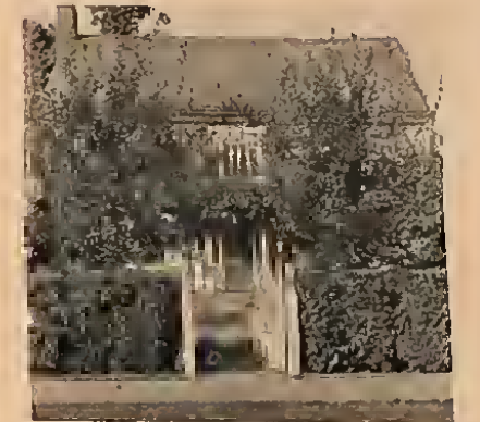
Clipped evergreen hedges are attractive winter and summer.