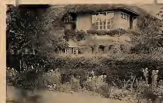
This Spruce hedge requires little shearing, looks well the year round.