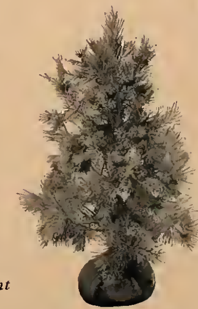
Evergreens will conceal a high basement.

GUARANTEE All plants are absolutely guaranteed as to kind, size and quality. If not satisfied, return shipment immediately at our expense and get your money back. Prices f.o.b. Framingham, Mass.