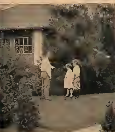
To conceal a garage—use Douglas Fir or White Pine.