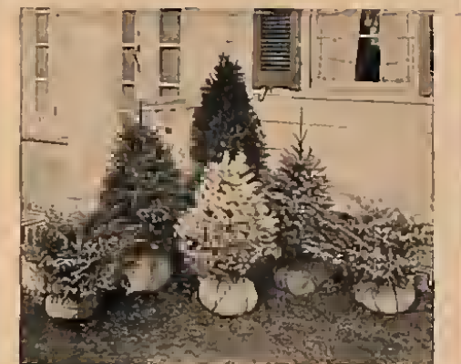
You can arrange your plants before planting.