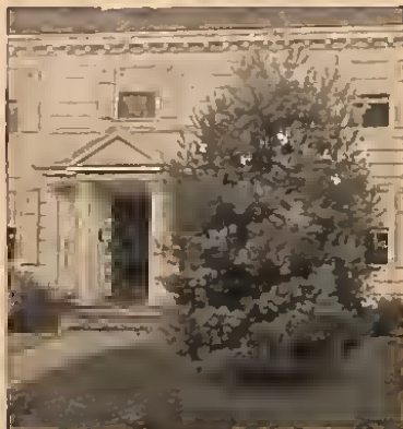
Evergreens on the lawn—Pine trees are splendid.