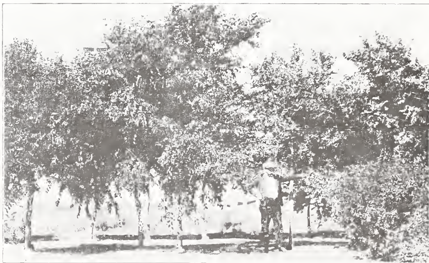
AGRICULTURAL COLLEGE SUB-STATION, HETTINGER, N. D.

The Ulmus Pumila in northern Korea and Manchuria is often a tree 80 feet tall with a trunk 12 feet in girth. It grows very rapidly here and is said to do the same in the Middle West."