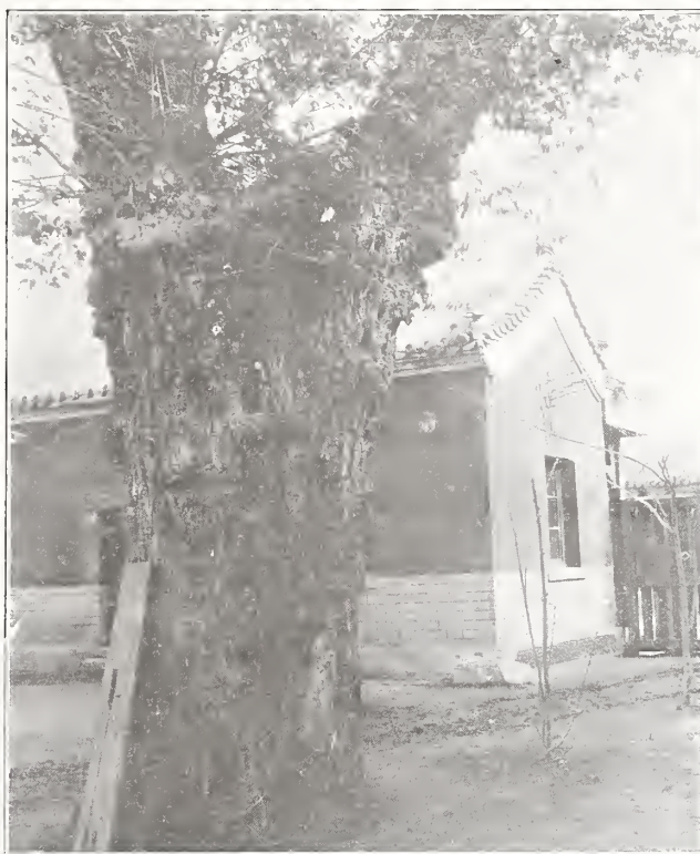
of CHINESE ELM in Pekin, China Said to be 300 Years Old