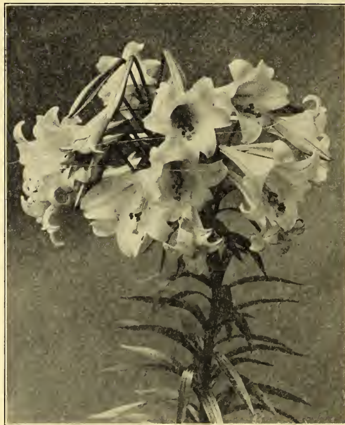
LILIUM ERABU—A. B. C. TRUE STRAIN

Sizes 6-8 in., 7-9 in., 8-10 in., 9-10 in., 10-12 in., 11-13 in. Write for Prices.