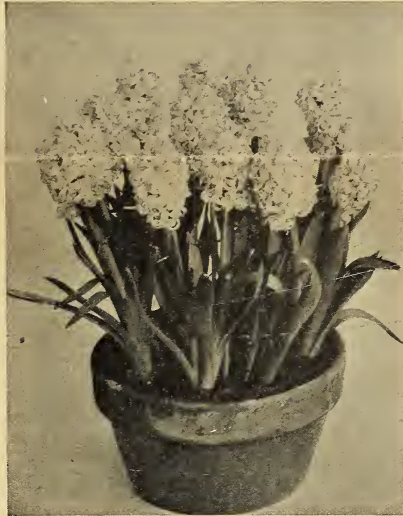
Dutch Hyacinth Gertrude, From Second Size