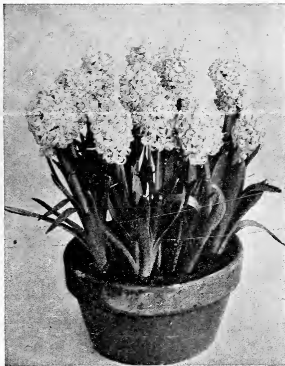
Dutch Hyacinth Gertrude, From Second Size