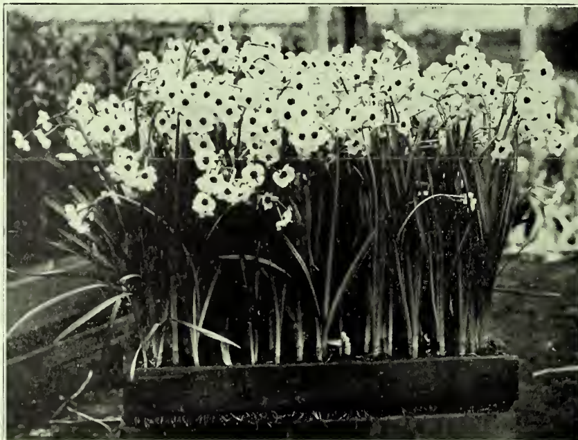
Flat of Laurens Koster from bulbs grown on our Texas farms; forced by Holm & Olson, St. Paul, Minn., who buy 60,000 Texas-grown Narcissi from us annually.

Imperator. Brilliant blue; good forcing size; 7 to 8 ctm., per 100, $3.50; per 1000, $30.00. Yellow Queen. Uniform yellow; good forcing size; 7 to 8 ctm., per 100, $5.00; per 1000, $15.00. Best two varieties for forcing.