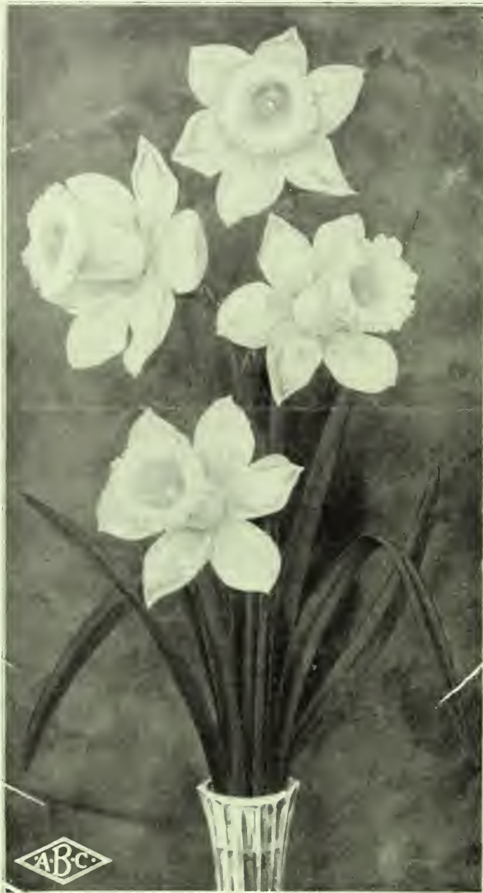
KING ALFRED from Texas grown bulbs.