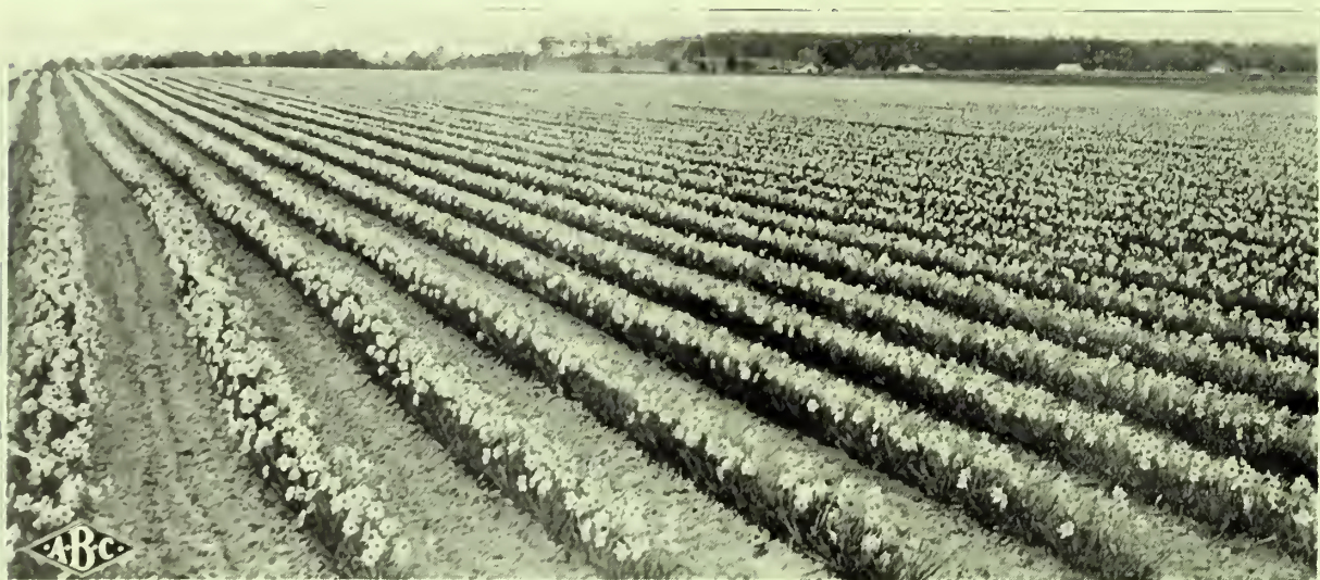
Sir Watkin in bloom in Texas; we have 2,000,000 of this variety.

American Bulb Co. 1335 W. Randolph St., CHICAGO 31 West 27th St., New York