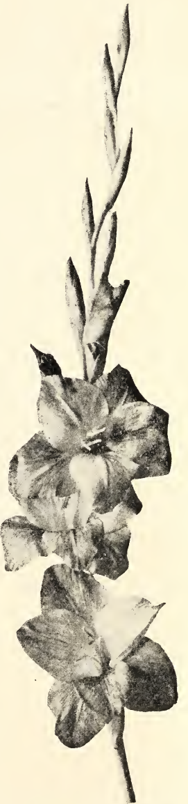
Seedling Blue Ridge

There are from one to a dozen bulbs and many bulblets in each Seedling variety.