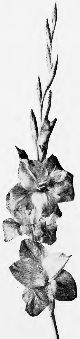
Seedling Blue Ridge