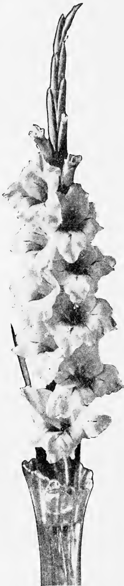
Seedling Western Sky

There are from one to a dozen bulbs and many bulblets in each Seedling variety.