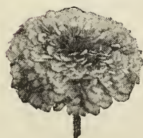
BODGER'S GIANT DAHLIA FLOWERED ZINNIAS

It might be well to call attention to the fact that many of the named varieties of the Dahlia Flowered type have made a good accounting for themselves in the Wisley trials. For instance, Giant Attraction was awarded an Award of Merit in 1930; Canary Bird, Golden Dawn, Oride, Scarlet Flame, Youth, as well as the Gold Medal Mixed, were highly commended in 1930. In the Giant Mammoth or California Giant group Lemon Queen and Scarlet Gem received highly commended recognition. Several of the Pumila and Lilliput types also made a good showing.