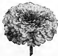
BODGER'S GIANT DAHLIA FLOWERED ZINNIAS

It might be well to call attention to the fact that many of the named varieties of the Dahlia Flowered type have made a good accounting for themselves in the Wisley trials. For instance, Giant Attraction was awarded an Award of Merit in 1930; Canary Bird, Golden Dawn, Oride, Scarlet Flame, Youth, as well as the Gold Medal Mixed, were highly commended in 1930. In the Giant Mammoth or California Giant group Lemon Queen and Scarlet Gem received highly commended recognition. Several of the Pumila and Lilliput types also made a good showing.