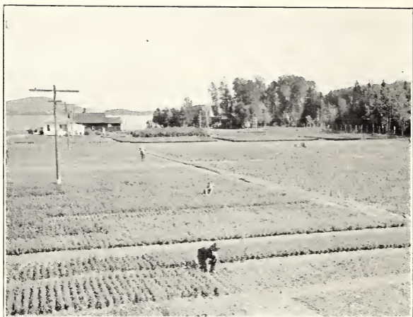
WEST FIELD AND OFFICE

If you would like to raise trees from seed, send for information to our Forestry Division at Berlin, New Hampshire.