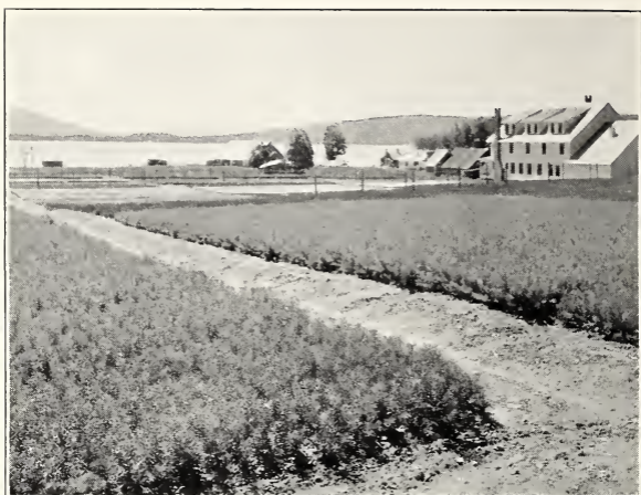
5 YEAR MUGHO PINES