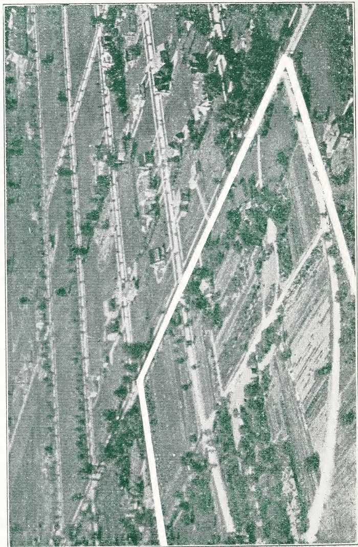
Aerial View of Our Sales Grounds