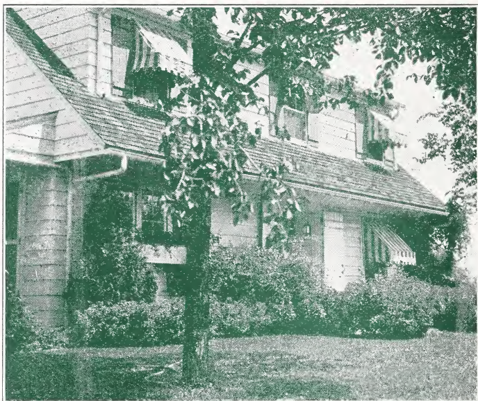
A Compact Foundation Planting

BUTTERFLY BUSH or SUMMER LILAC— Buddleia davidi —4 to 5 ft.