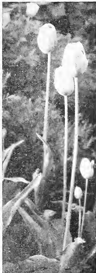
DARWIN LA TRISTESSE