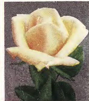
Duchess of Wellington