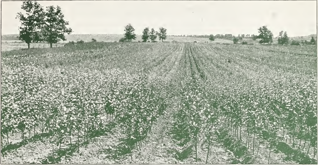
A block of 2-year budded Apples at Newark. Left to right, Baldwin, Cortland, Delicious, McIntosh