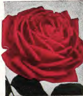
Francis Scott Key