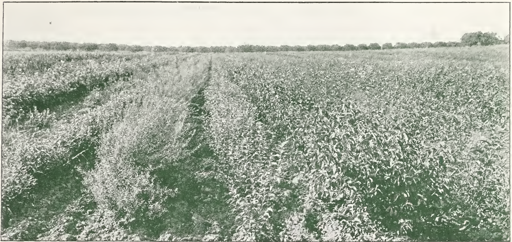
One of our 2-year shrub blocks at Newark. Photographed August, 1930