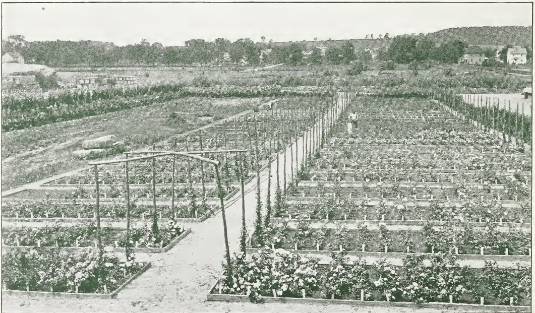
The J. & P. Rose Test-Garden, planted spring, 1930, photographed in August. In another year this should be a glorious sight, but the photograph, as shown here, indicates the thorough testing we give to all new varieties, growing them under regular garden conditions.

We cannot undertake to supply long and much assorted lists of stock calling for only small bundles of each kind, as our business is exclusively wholesale and we do not have the facilities to handle retail orders