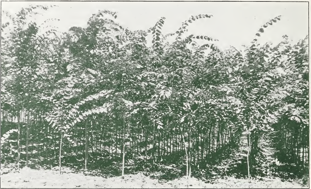
American Elms. This photograph, taken August, 1930, shows a part of one of our young blocks