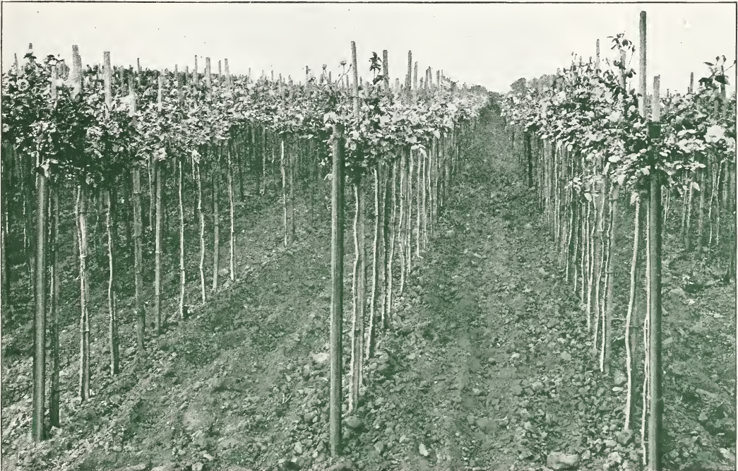
Standard or Tree Roses at Shiloh having strong, sturdy stems and well-developed heads

We cannot undertake to supply long and much assorted lists of stock calling for only small bundles of each kind as our business is exclusively wholesale and we do not have the facilities to handle retail orders