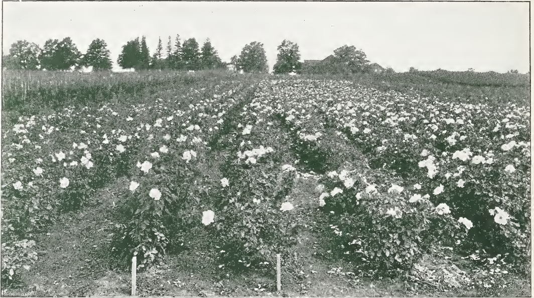
A part of our Newark Rose block—Anna de Diesbach and Frau Karl Druschki. Photographed August, 1930