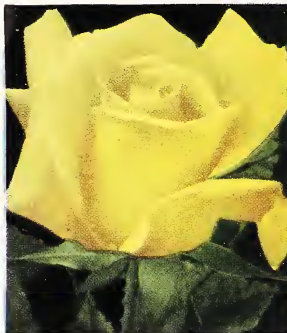
Souv. de Claudius Pernet