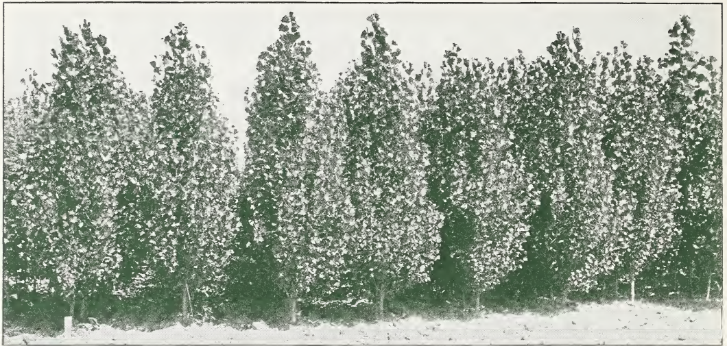
Lombardy Poplars at Newark, properly grown, branched to the ground. Photographed August, 1930