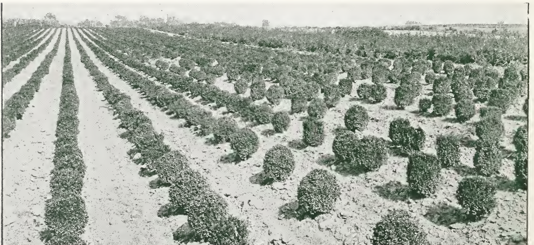
Our block of Ball-shaped Boxwood at Shiloh. Photographed this summer