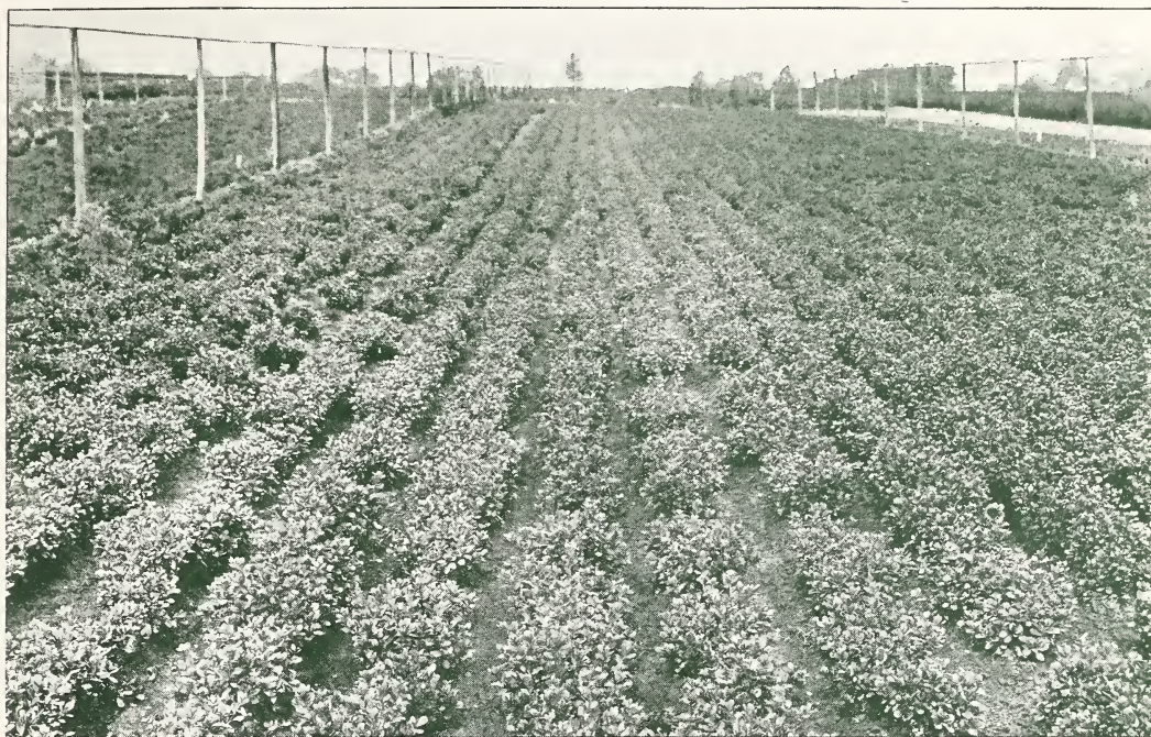
Azalea Hinodegiri at Shiloh, properly spaced to develop well-rounded plants