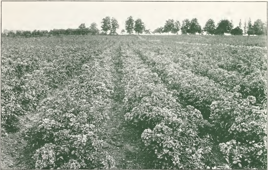
The best block of Baby Roses we have produced in many years. Photographed August, 1930