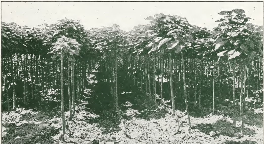
Our block of Catalpa bungei , 2-year heads. Photographed August, 1930