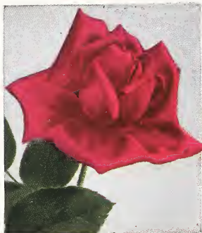
Etoile de France