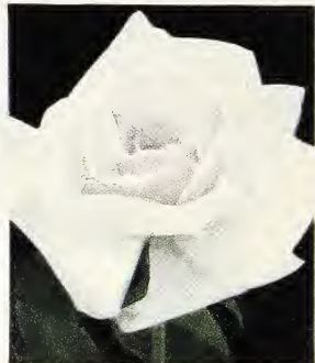
Mme. Jules Bouche