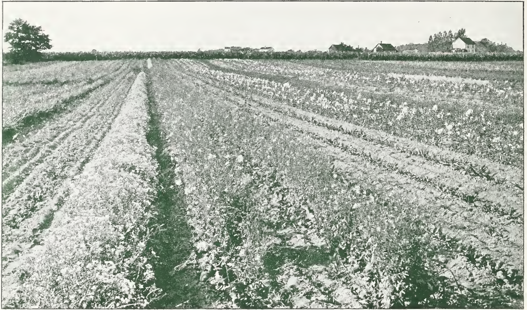
Hardy Perennial Plants at Newark. We are offering an excellent assortment of strong transplanted stock