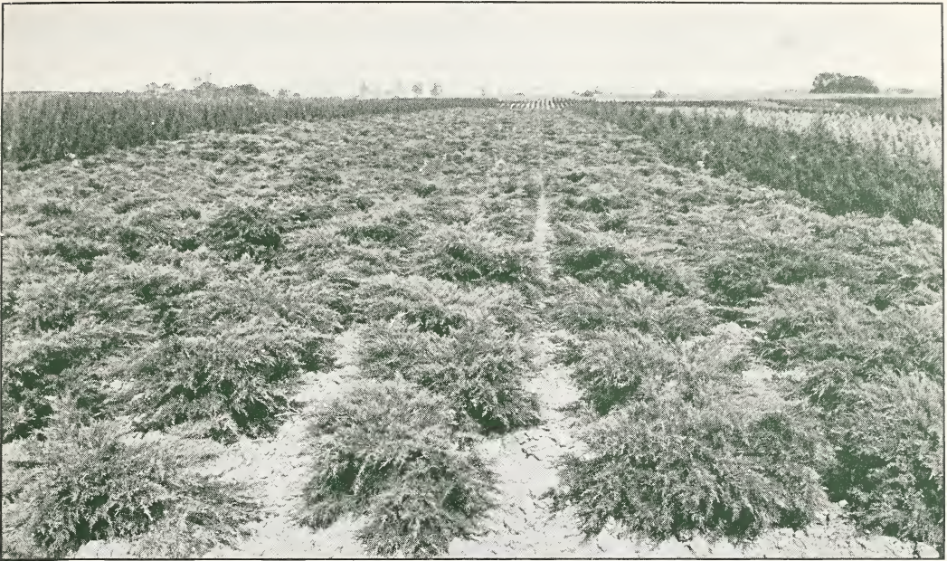
Our block of Pfitzer's Junipers, photographed at Shiloh, August, 1930. Note the care used in spacing and trimming in order to develop well-rounded plants.