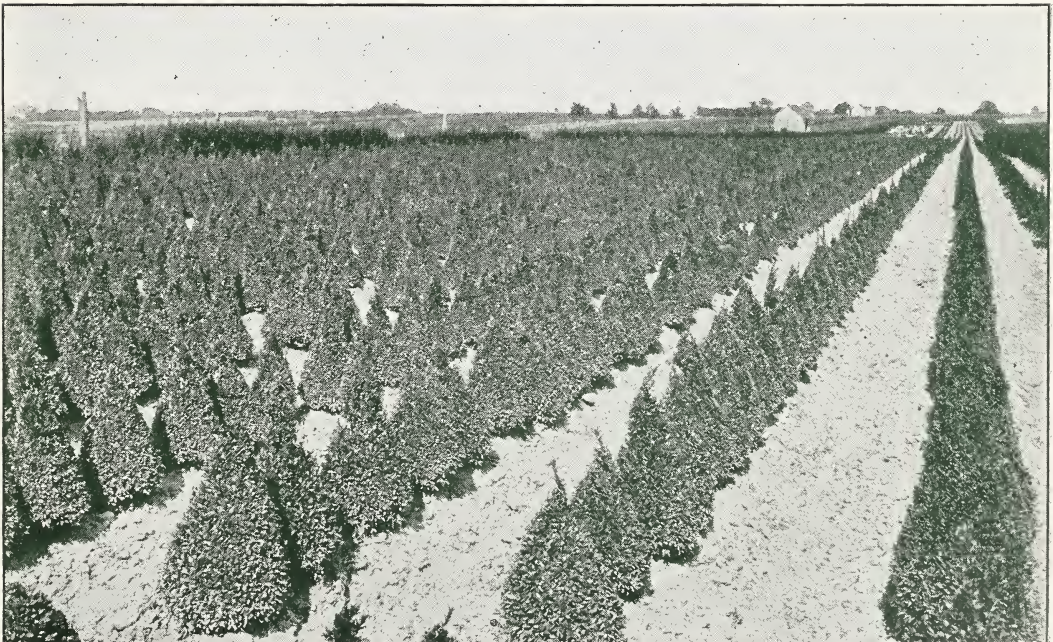
Pyramidal Boxwood, 15 to 18 and 18 to 21 inches high. Photographed at Shiloh, August, 1930