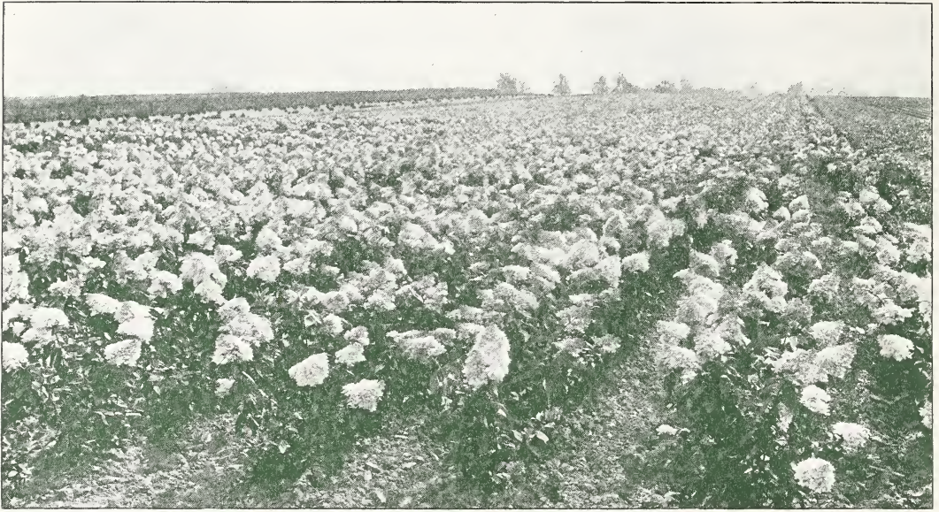
Hydrangea Peegee, well rooted and bushy. A J. & P. Specialty