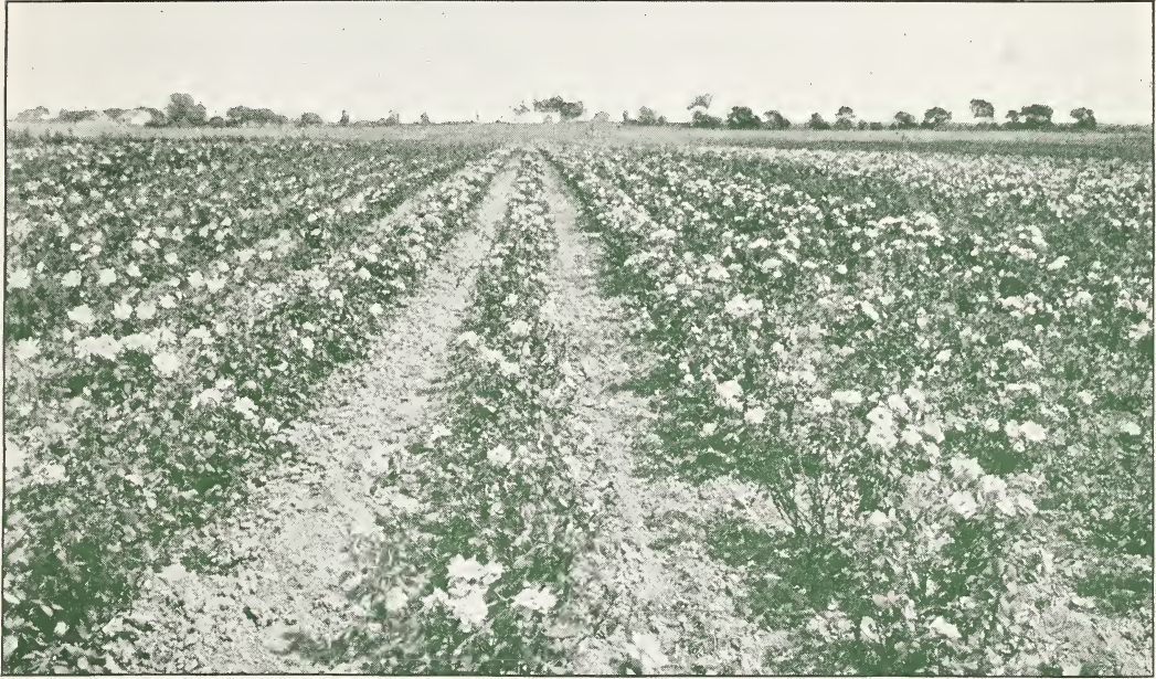
Another part of our Hybrid Tea Roses at Shiloh, showing Ophelia and Mme. Butterfly in the foreground