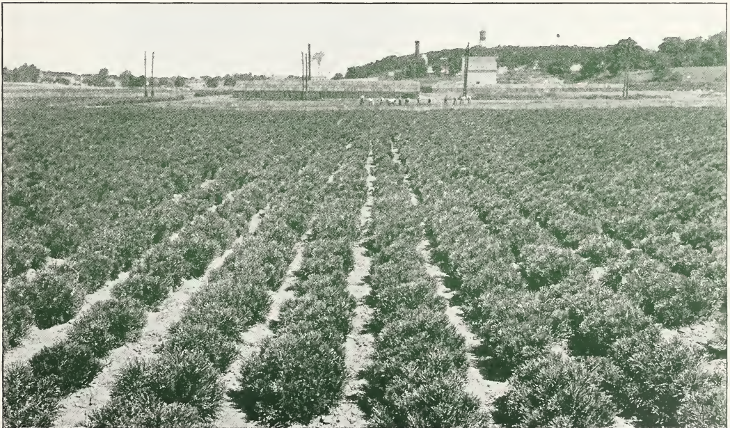
Block of Mugho Pines. A very dwarf strain grown from seeds from the high Alps. Photographed August, 1930