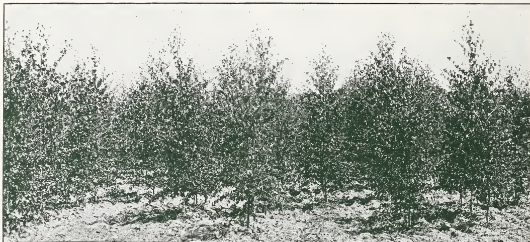
Cut-leaved Weeping Birch, another J. & P. Specialty given plenty of room in the nursery rows to develop properly