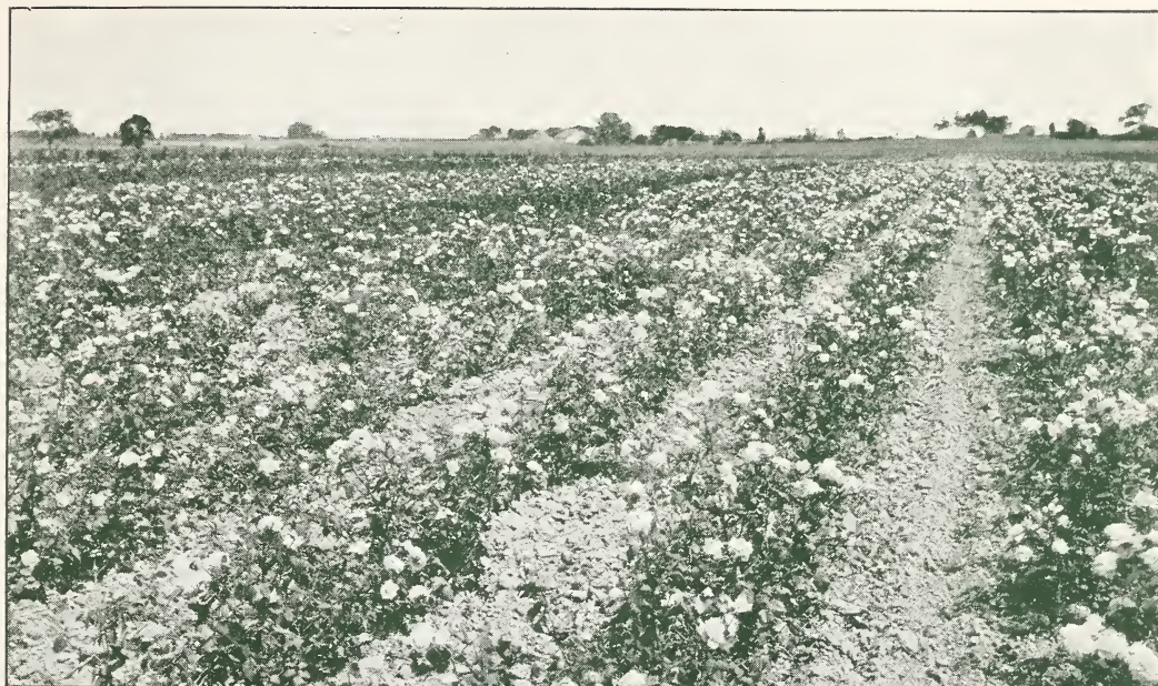
Hybrid Tea Roses on Multiflora Japonica stock at Shiloh—a part of our 1930 block