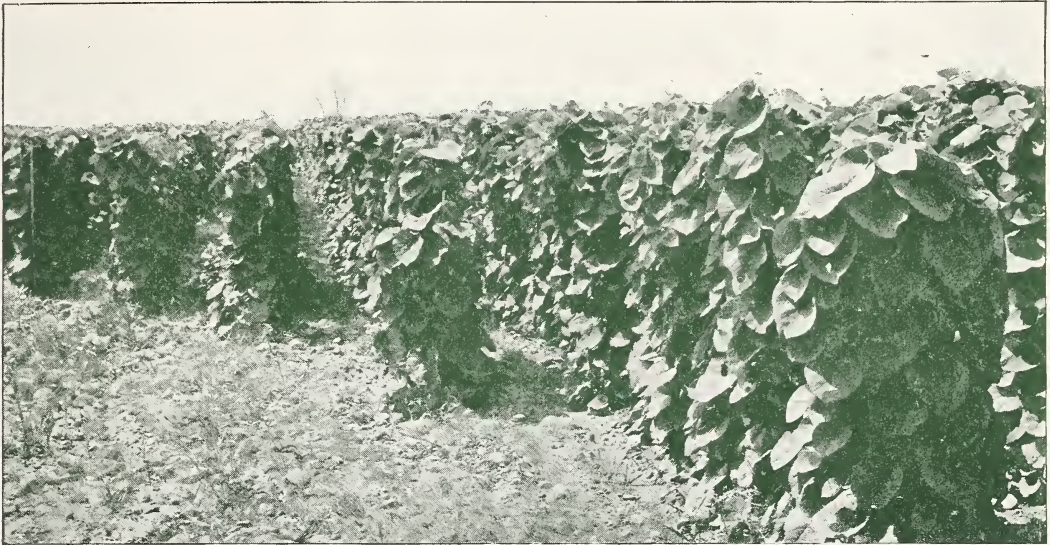
Dutchman's Pipe at Newark. Real he plants. True Aristolochia siphon