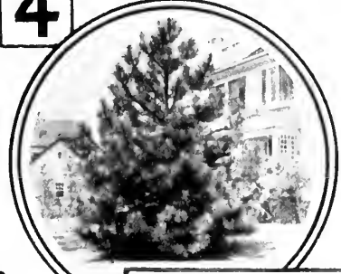
4 AUSTRIAN PINE

The Norway Spruce is so well-known and so popular it hardly needs to be introduced or explained to the lover of nature. While it is more common than some others it nevertheless is beautiful. It is easily cultivated and cared for. Its deep rich color is needed among the plantings of other evergreens. It is nicely shaped and grows rapidly. The Norway Spruce adapts itself to every climate and most every soil. It withstands the rigors of all weather conditions and is truly a desirable tree for home planting.