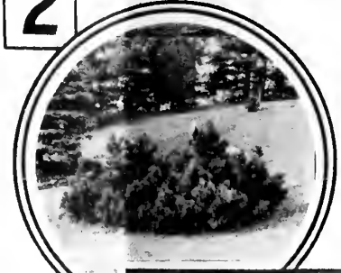
2 MUGHO PINE

One of America's foremost authorities calls the Colorado Blue Spruce nature's highest effort to produce the beautiful. Here is a tree of majestic splendor. Picture, if you will, a tree of perfect shape, with abundance of foliage glistening in the sunlight like flashes of steel. You have seen trees laden with soft, white fluffy snow that resemble the beauty of the Colorado Blue Spruce: What a thrill you will experience to grow and develop these youngsters in your own yard.