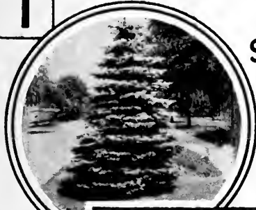
1 COLORADO BLUE SPRUCE