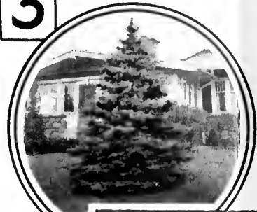
3 NORWAY SPRUCE

The Mugo Pine is a mountain plant which has become adapted to home planting. Mugo Pines have been costly due to the expense of obtaining proper seeds in the earlier days. Around the base of the foundation, at the foot of the steps, next to the taller trees and along the pathways they present an object picture one can scarcely imagine. The new shoots of spring and early summer are silvery, like little glowing candles. Mugo Pines do not grow tall but spread out along the ground in the most artistic formation. Nooks and corners are made beautiful by Mugo Pines and at the price they are offered here you will readily find use for a great many.