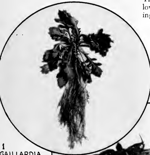
1 GAILLARDIA (orange)