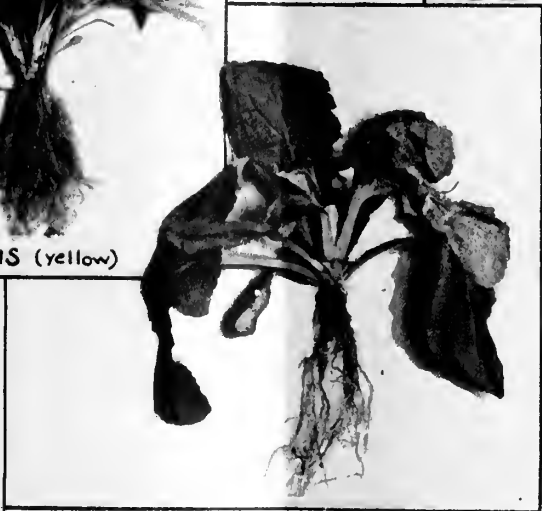
6 FOXGLOVE (red)