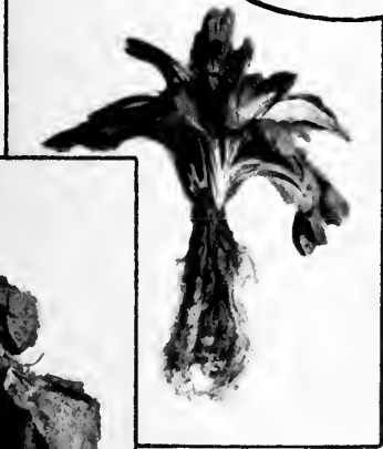
4 SHASTA DAISY (white)