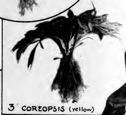
3 COREOPSIS (yellow)