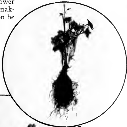
5 DELPHINIUM (BLUE)