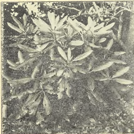
Rhododendron Maximum, burnt over clump, three to four feet.