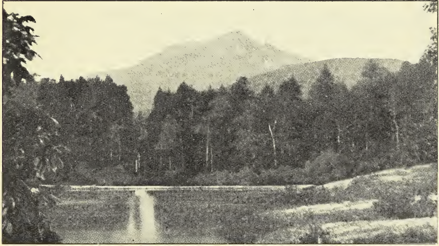
Grandfather Mountain. Elevation, 5,997 feet Included in the area owned by the Linville Improvement Company