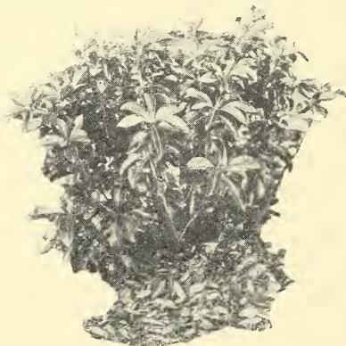
Kalmia latifolia , two to three feet burnt over clump.

KALMIA LATIFOLIA. Mountain Laurel, Calico Bush. Gives a fine effect, when inter-planted with Rhododendrons. Does well in either sun or shade.