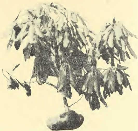
Rhododendron Maximum Natural Growth, two to three feet.