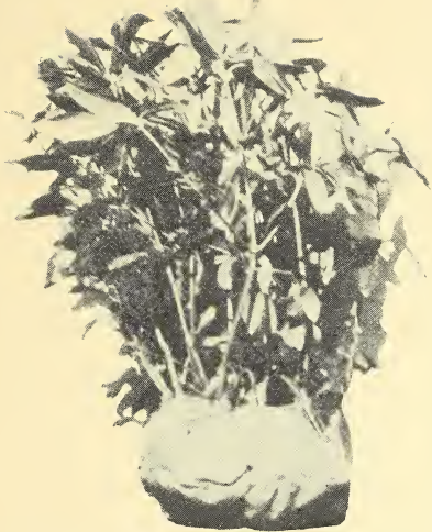
Rhododendron Catawbiense, burnt over clump, three to four feet.