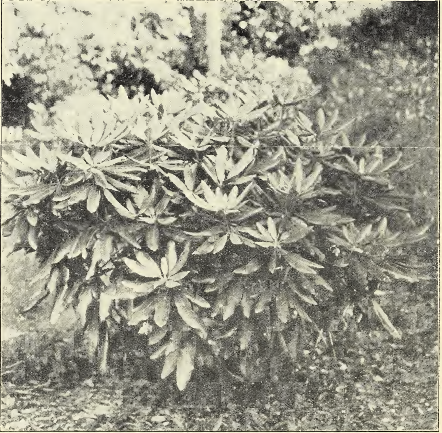
One of our four to five feet Rhododendron Maximum, burnt over clump, one year after being transplanted at Augusta, Georgia.