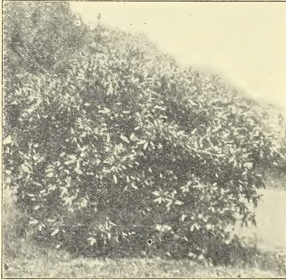
Photograph of a specimen plant of a cut-back or burnt over Rhododendron Maximum 10 feet high, with a spread of 10 feet, at Linville, N. C. We can supply these specimens of various sizes in carload lots from $12.50 to $150.00 each. Ask for specifications.