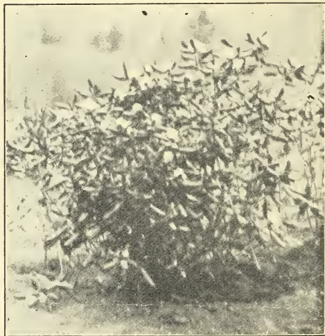
Rhododendron carolinianum , three to four feet clump.