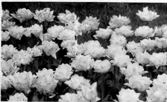
Double Tulips, Couronne d'Or.