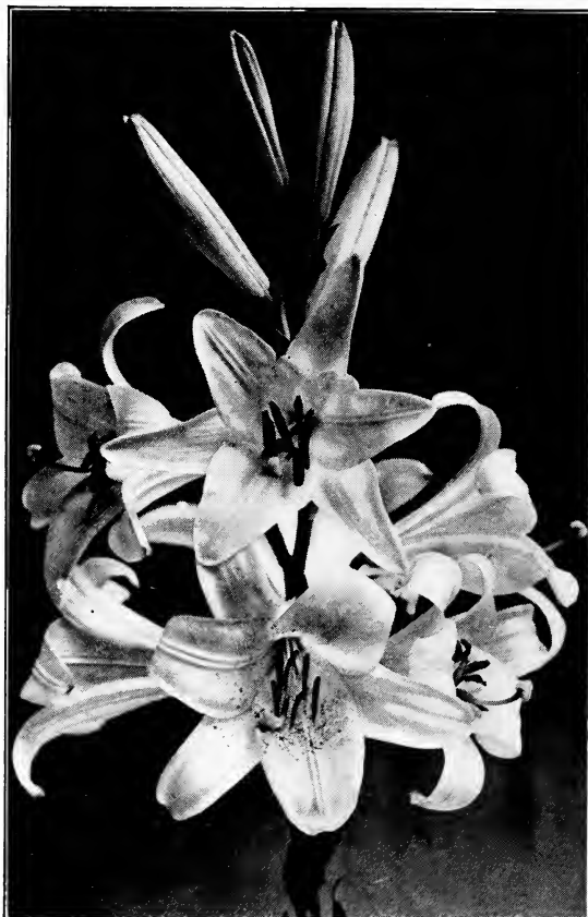
Lilium Candidum, Madonna Lily.

SUPERBUM (Turk's Cap Lily). One of our native species.