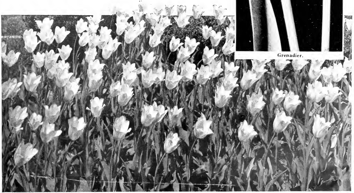
Cottage Tulip, Mrs. Moon, in Garden Planting.