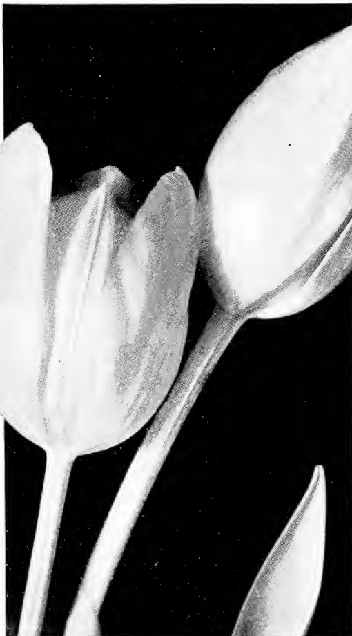
Cottage Tulip, John Ruskin.

Granulated Peat Moss is Better Than Manure