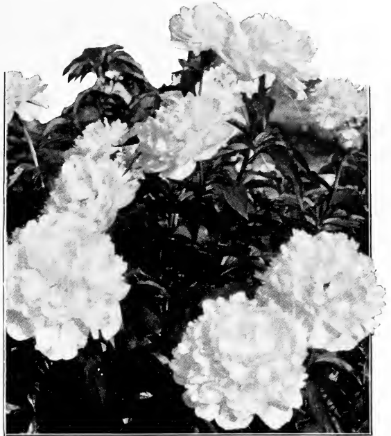
A clump of Peony Festiva Maxima.