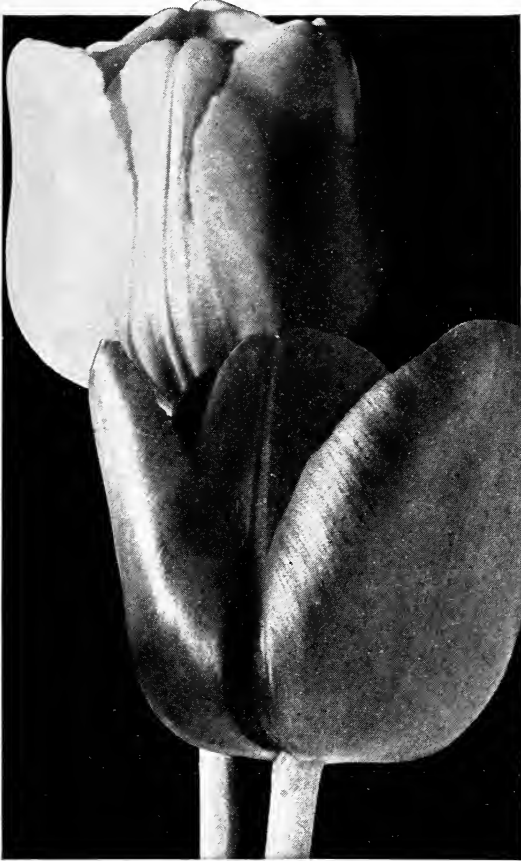
Darwin Tulips, Afterglow and La Tulipe Noire.

NOTE—6 bulbs at dozen rate; 25 bulbs at 100 rate.