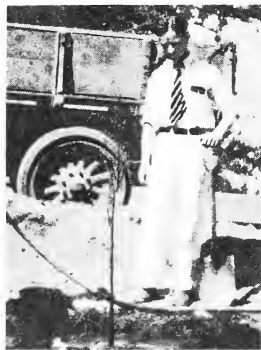
MAY 17, 1929