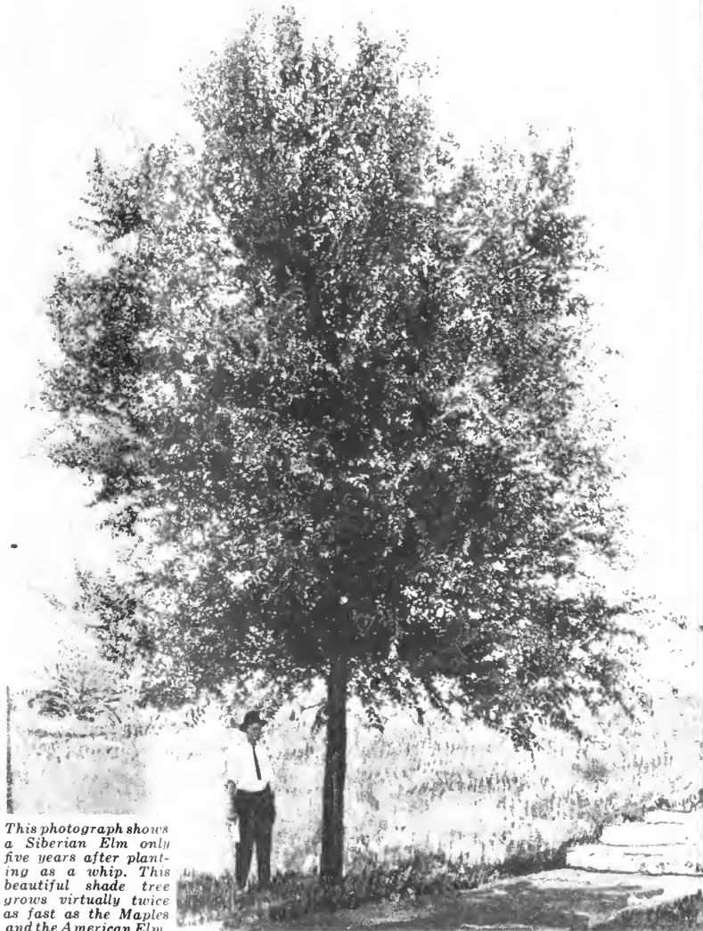
This photograph shows a Siberian Elm only five years after planting as a whip. This beautiful shade tree grows virtually twice as fast as the Maples and the American Elm.

“It is hardy and has proved valuable under a greater variety of climate and soil conditions than any tree yet introduced.”