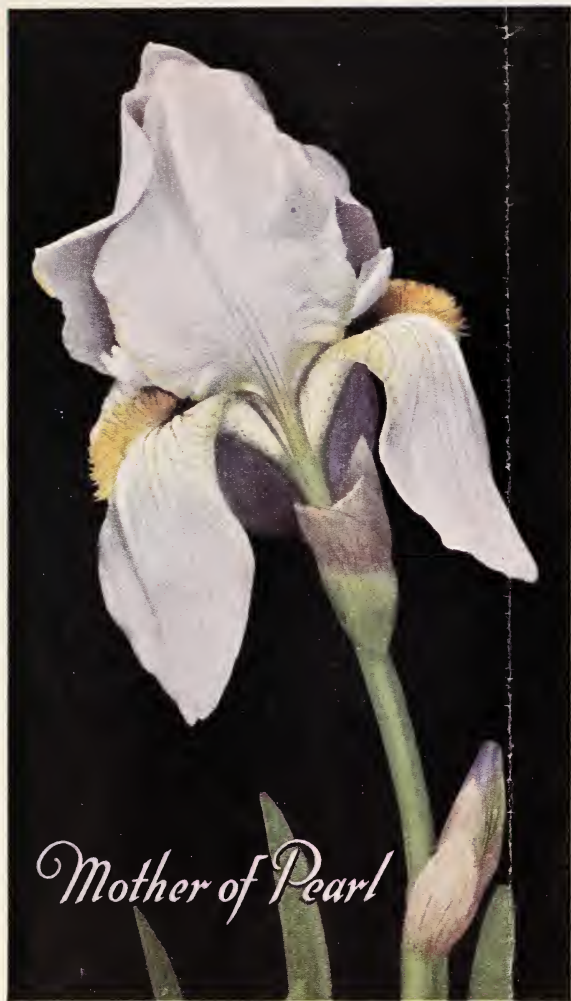
Mother of Pearl

THIS beautiful Iris is undoubtedly one of the world's best. In addition to its wonderful substance and delicate beauty, it is a most vigorous grower and prolific bloomer. The following description can not begin to do the flower justice—it must be seen to be appreciated.