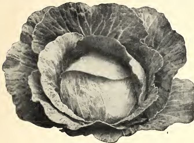
Wood's Prize Head Late Flat Dutch

CABBAGE One ounce will produce 2,000 plants; 6 to 8 ounces will produce enough plants for an acre.