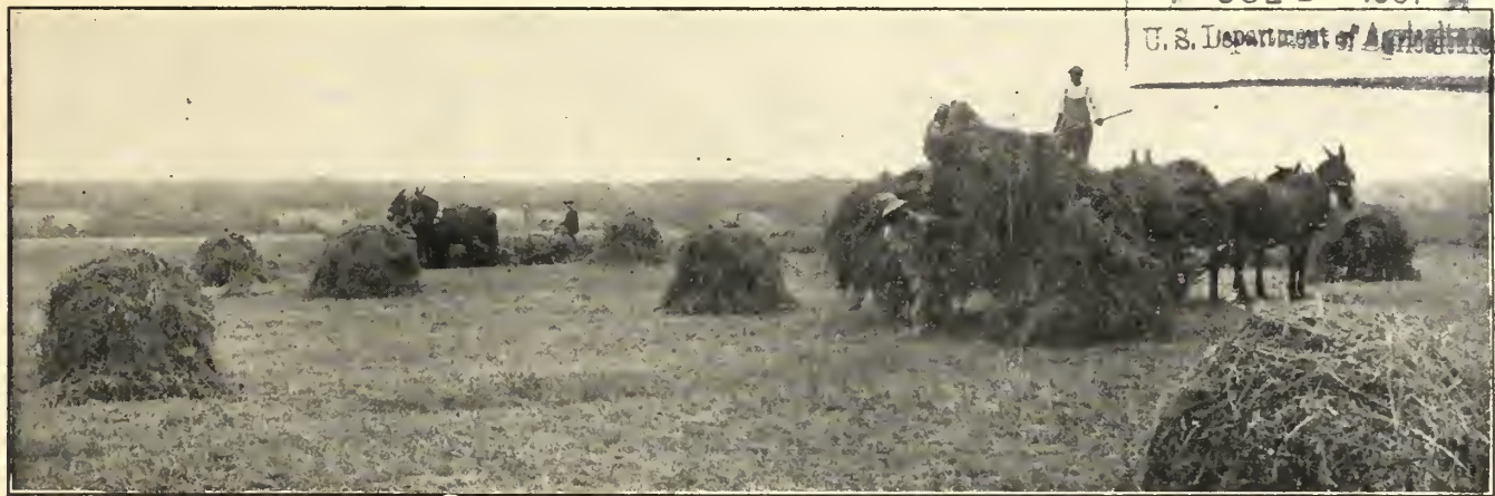
SOJA BEANS MAKE ONE OF OUR BEST SUMMER HAY CROPS

LIBRARY 1931 RECEIVED ★ JUL 1 1931 ★ U. S. Department of Agriculture