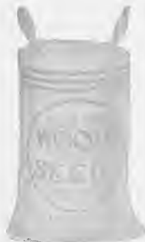
Only New Bags used in shipping Wood's Seeds

WE OFFER only the leading and most dependable strains of Certified and Pedigree strains, every bushel 100% pure seed wheat, true to name and containing no other crop seeds.