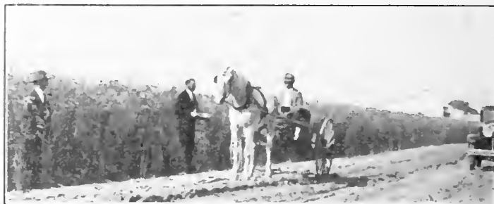
Pedigree Abruzzi Rye as Grown in North Carolina

are economical crops to sow. Note new low prices in this Crop Special.