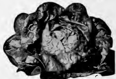
Wood's Cabbage Lettuce