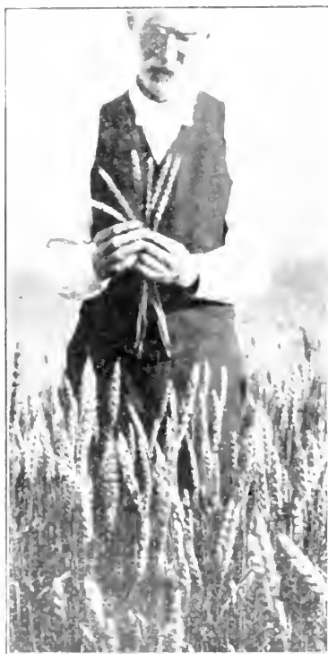
Note the long, heavy heads of Wood's Forward Wheat.

Changing your seed for better yielding strains can be accomplished at the lowest cost in years. A good year to put your farm on a higher producing basis. The varieties noted below are highly recommended for fall seeding: