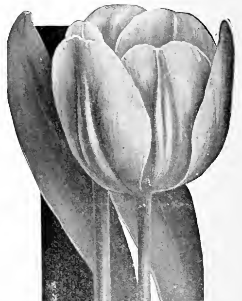
Clara Butt Darwin Tulip

WOOD'S SPECIAL MIXED DARWIN TULIPS —Composed entirely of named sorts, and contains a great variety of all colors and shades. 60c. per doz.; $3.50 per 100, postpaid. Not prepaid, 50c. per doz.; $3.25 per 100.