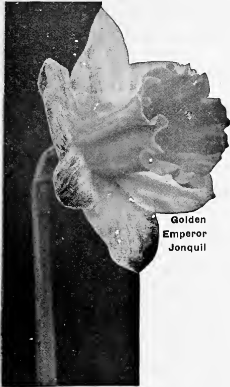
Golden Emperor Jonquil