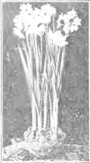
Giant White Narcissus

Each, 10c.; 85c. per dozen; $6.25 per 100, postpaid. Not prepaid, 75c. dozen; $6.00 per 100.