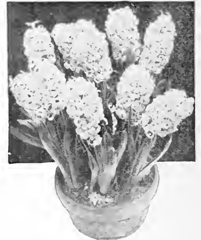
Wood's Superior Hyacinths