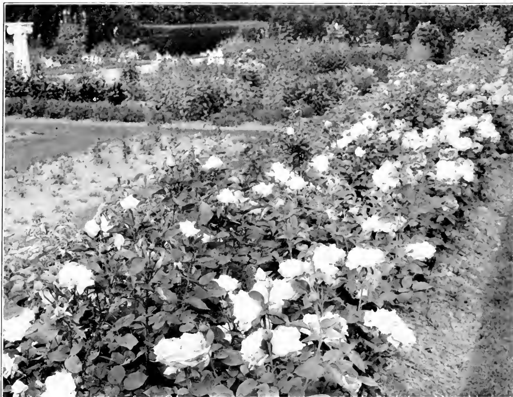
It's easy to have lovely Roses in abundance