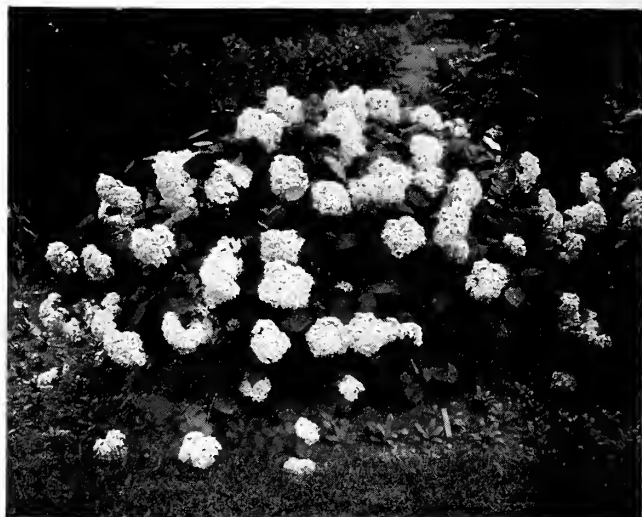
This Hydrangea is well named Hills of Snow

Catalog describing evergreens, shrubs and flowers mailed on request