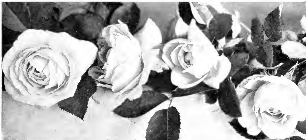
These strong two year plants will give you beautiful roses a few weeks after planting.

These strong two year plants will give you beautiful flowers a few weeks after planting, and all summer till fall. flowers of superb form, beautiful colors and delightful fragrance. Plant 15 to 18 in. apart. T. indicates Tea. H. T., Hybrid Tea. Per., Pernetiana, Pol., Polyantha. For distinguishing characteristics see page 7.