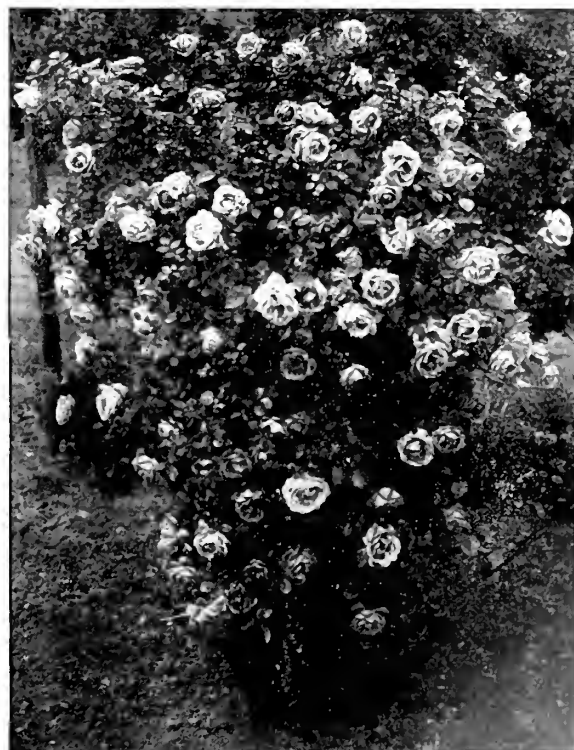
Climbing American Beauty, used as a pillar rose.

For chewing insects which eat the foliage a stomach poison is used, usually arsenate of lead as a spray or dust. Used in pow-