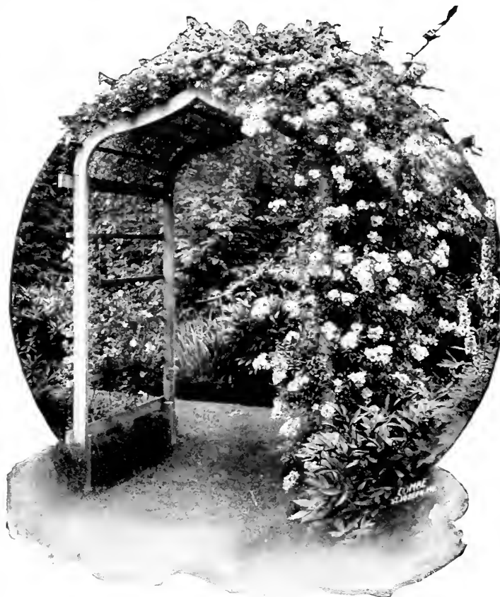
For an arched entrance, what can be more appropriate than Ramblers

Slender, deep yellow buds in clusters, opening creamy-white with a bright yellow center; semi-double; early; blooms freely; vigorous growth, reaching 20 feet; H. M. Rambler.