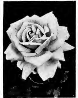
Souv. de Claudius Pernet