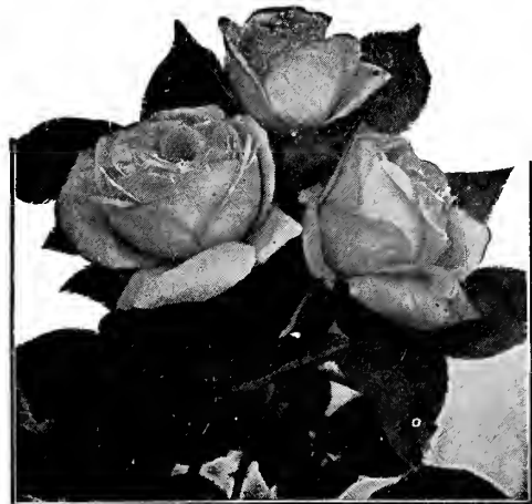
Paul Neyron , perhaps the largest of roses

A little booklet the size of this, describing the different types of rock gardens, with suggestions for construction and planting. It contains a lot of information in a little space. Write for it if you haven't a copy.