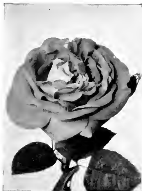
Gruss an Teplitz

Long, pointed buds; the nearly open flowers are distinct coral-red becoming orange-pink, finally lighter before they shatter;