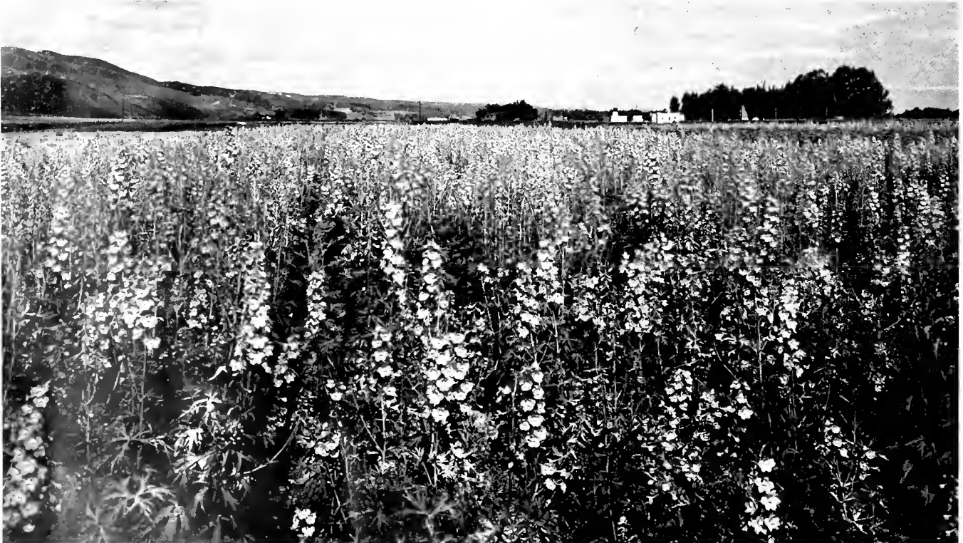
FIELD VIEW OF DELPHINIUM CLIVEDEN BEAUTY, taken on our ranch at Lompoc, California, May 26, 1932.