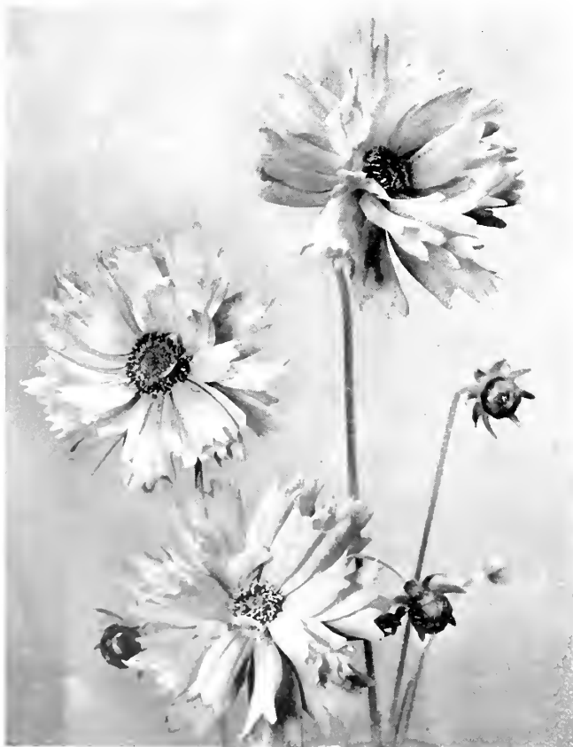
COREOPSIS DOUBLE YELLOW

This is the earliest blooming Eschscholtzia, coming into flower fully six weeks before the other varieties.