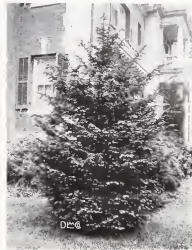
Abies douglasii (Douglas Fir). See page 2

C. filifera compacta. Dwarf Thread Retinospora. A dwarf form of the preceding variety; very compact.