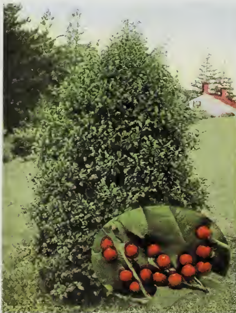
Ilex opaca (American Holly). See page 11