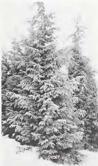
Tsuga canadensis (American Hemlock)