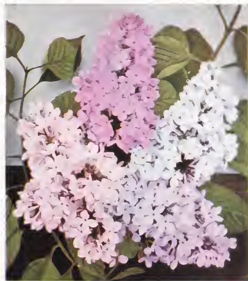
Hybrid Lilacs. See page 24

Deduct 10% of unit price for ten or more of one variety in one size