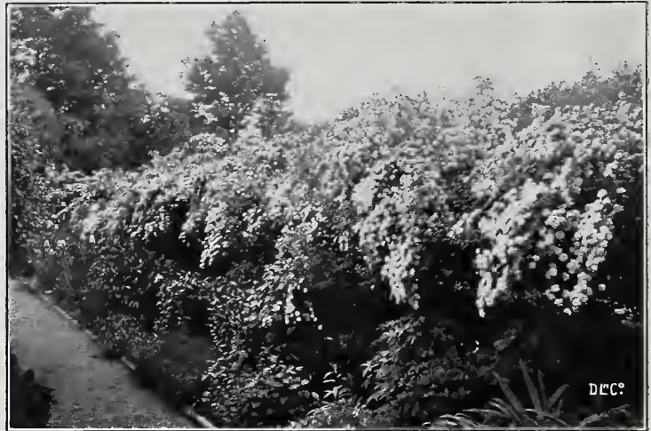
Mass Planting of Spiraea vanhouttei (Bridalwreath) See page 23

L. ovalifolium. California Privet. Globe Form (Sheared). Trained in globe shape. It transplants easily.