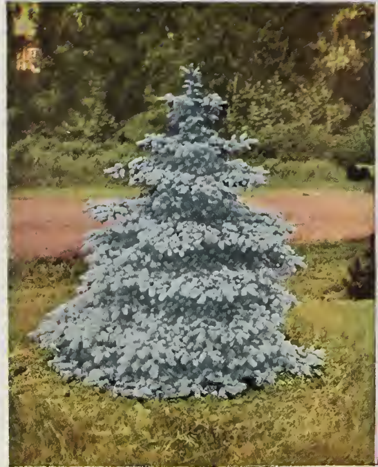
Picea. (Koster Blue Spruce)

P. kosteri. Koster Blue Spruce. This is the bluest of the Spruces. In form and habit of growth it is compact, symmetrical and shapely, and because of its intense coloring, it is considered the most desirable of all the fancy colored evergreens.