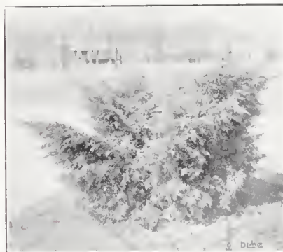
Juniperus pfitzeriana. (Pfitzer Juniper) See page 4

J. cannarti. Cannart Cedar. A fine, pyramidal evergreen of compact growth. Has a wonderful Winter color and is perfectly hardy. Deep rich green foliage.