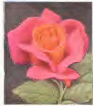
Pres. Herbert Hoover