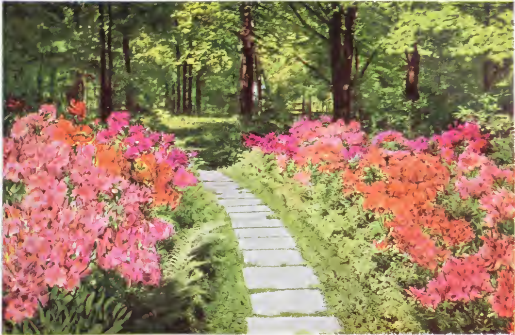
Azalea kaempferi (Torch Azalea)