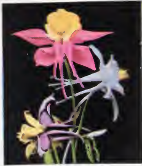
Aquilegia See page 28