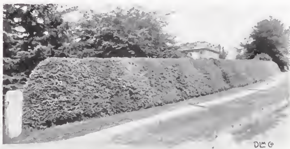
At a price you can afford