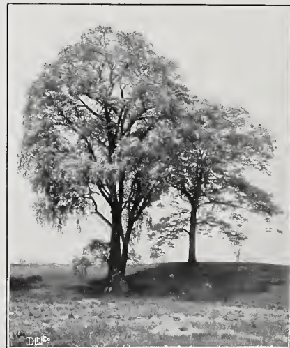
Ulmus americana (American Elm)

Deduct 10% of unit price for ten or more of one variety in one size