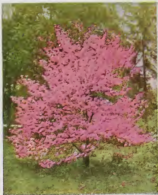
Cornus florida rubra (Pinkflowering Dogwood). See page 15