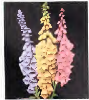
Digitalis See page 28

10 100 Strong plants, field grown . . . . . $2.00 $15.00 Strong plants, pot grown . . . . . 2.50 18.00