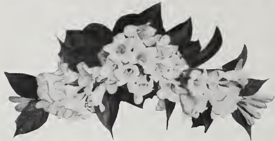
Weigela Eva Rathke