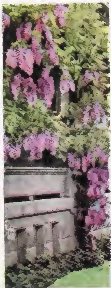
Wisteria sinensis (Chinese Wisteria)