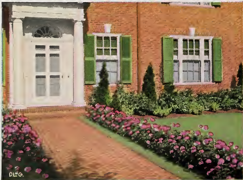
A Pleasing Combination of Evergreens and Border Planting

Deduct 10% of unit price for ten or more of one variety in one size