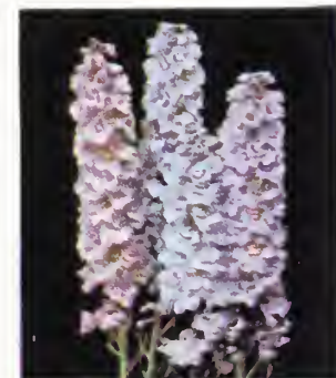
Delphinium See page 28