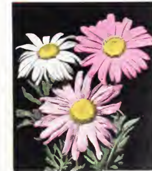
Pyrethrum See page 30