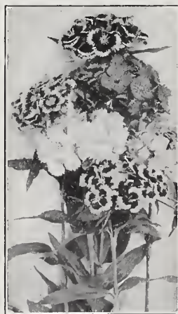
Dianthus barbatus (Sweet-william)

† BELLIS perennis. English Daisy. 6 in. Improved double flowering; various colors.