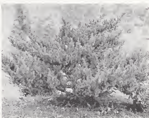
Taxus (Spreading Yew)

RETINOSPORA. See Chamaecyparis , page 3.