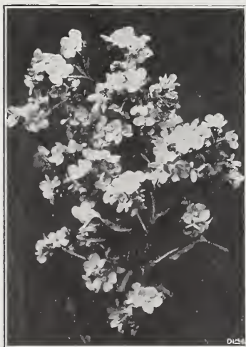
Anchusa italica, Dropmore

ASTILBE japonica, Queen Alexandra and Von Sicton. 1 to 2 ft. June. 35c. each, $3.00 for 10.