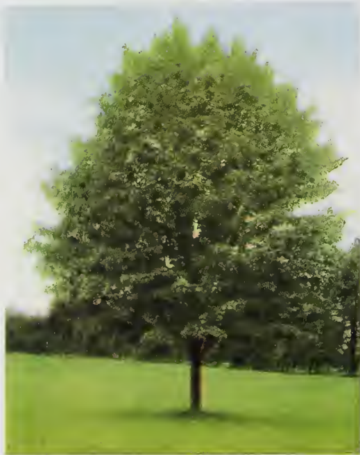
Acer platanoides (Norway Maple)