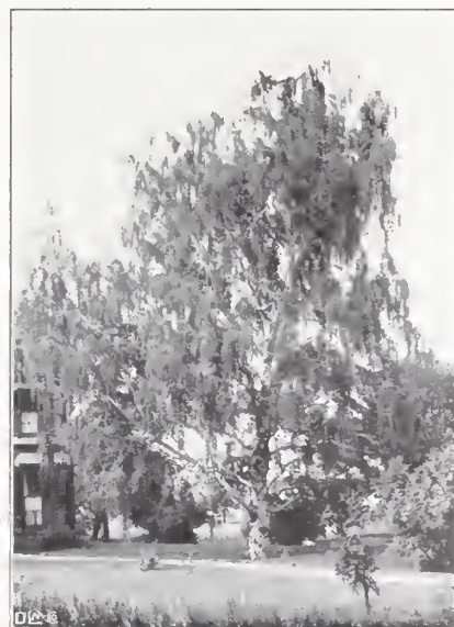
Betula alba laciniata (Cutleaf Weeping Birch)