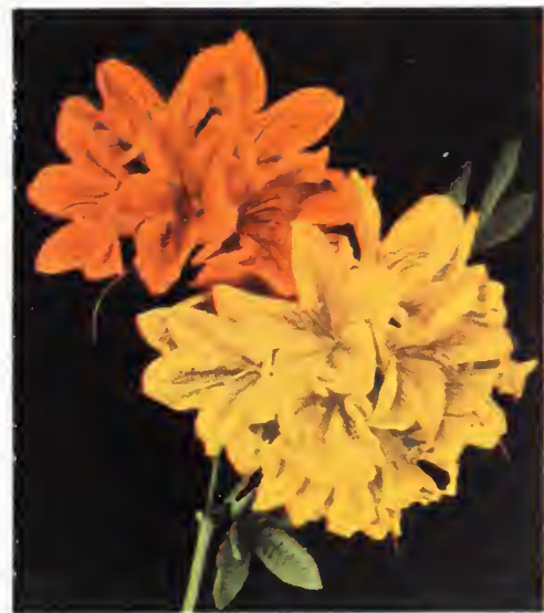
Azalea mollis (Chinese Azalea). See page 20

Deduct 10% of unit price for ten or more of one variety in one size