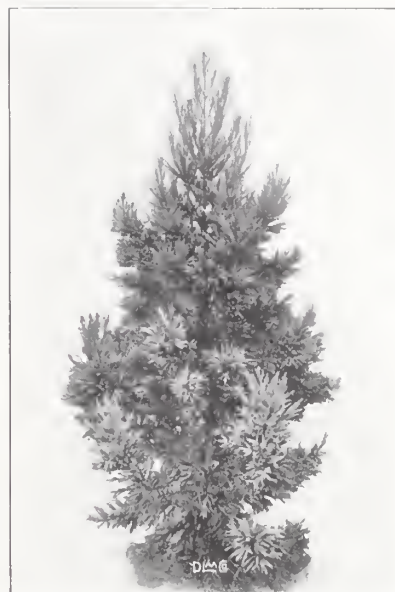
Cryptomeria japonica lobbi. (Japanese Cedar) See page 4

Deduct 10% of unit price for ten or more of one variety in one size