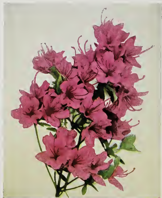
Azalea Hinodegiri (Japanese Azalea)

Deduct 10% of unit price for ten or more of one variety in one size