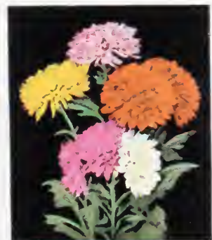
Hardy Chrysanthemums See page 28

3 plants of 1 var. . . $0.75 10 plants of 1 var. . . 2.00 100 plants of 1 var. . . 18.00