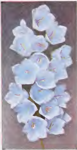
Campanula persicifolia See page 28

Prices of Perennial Plants, except where otherwise noted: