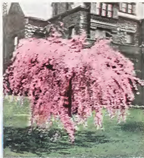
Prunus sieboldi (Japanese Weeping Pinkflowering Cherry). See page 18

Prunus cerasifera pissardi. Purpleleaf Plum. A popular, decorative tree with handsome, dark purple foliage in Spring and Summer. Wine red fruits. Each 6 to 8 ft. .... $3.00 | 8 to 10 ft. .... $6.00 10 to 12 ft. .... $9.00