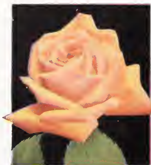
Duchess of Wellington