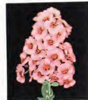
Phlox See page 30