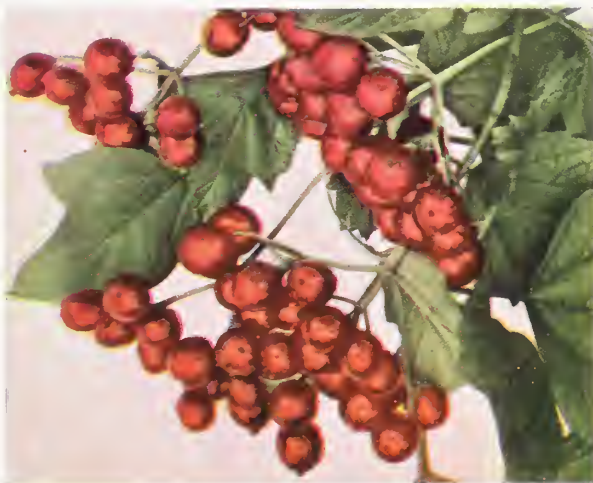
Viburnum opulus ( European Cranberrybush ). See page 24