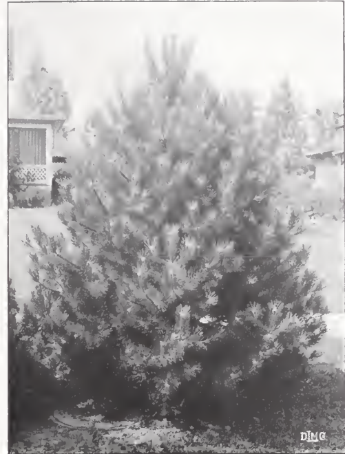
Pinus nigra (Austrian Pine)