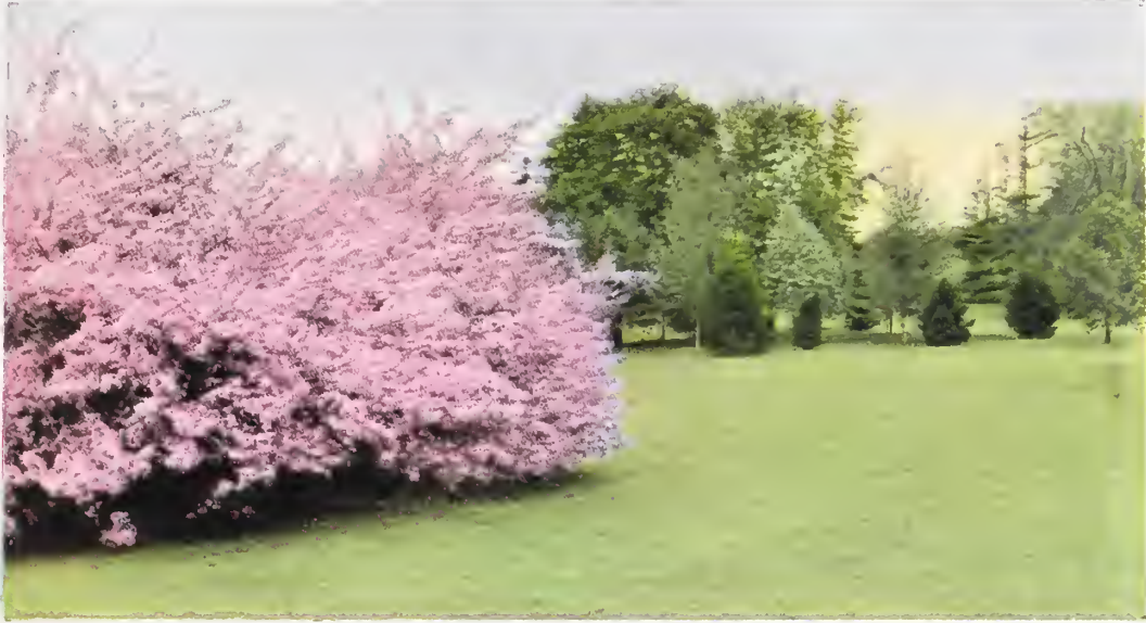
Bechtel Flowering Crab ( Malus ioensis plena )