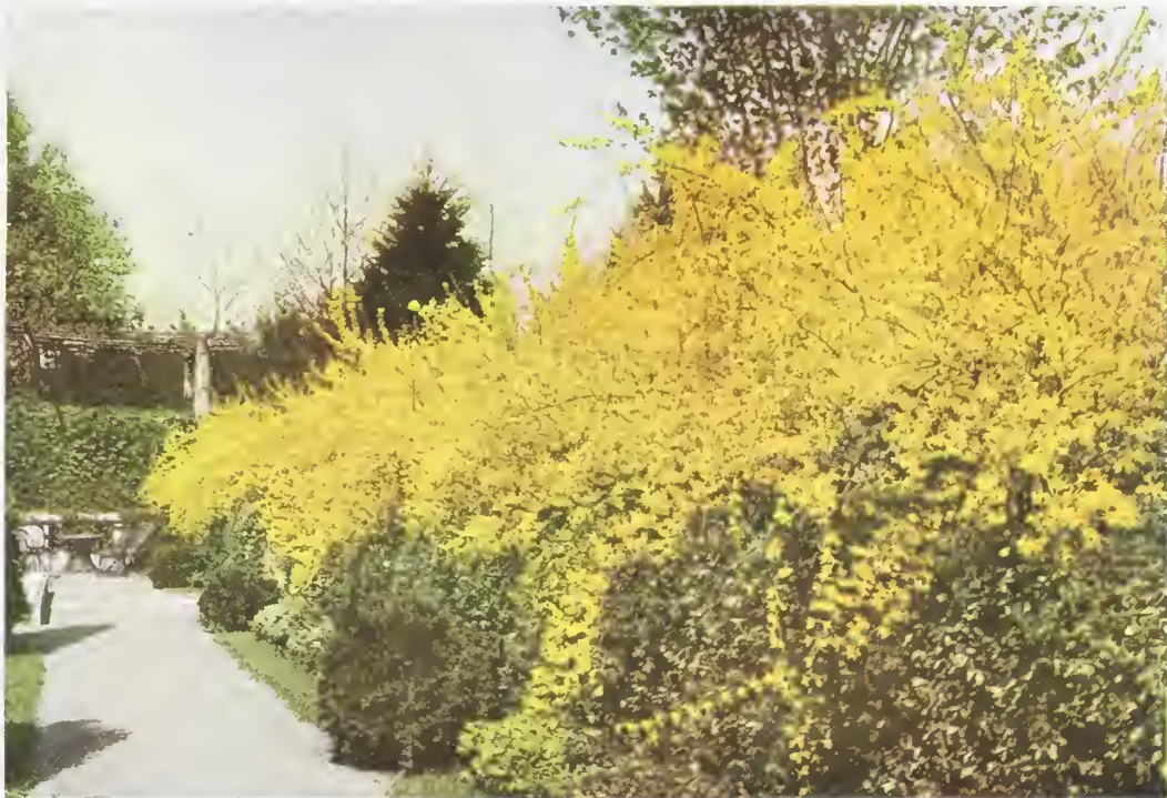
Forsythia suspensa fortunei (Fortune Golden Bell)