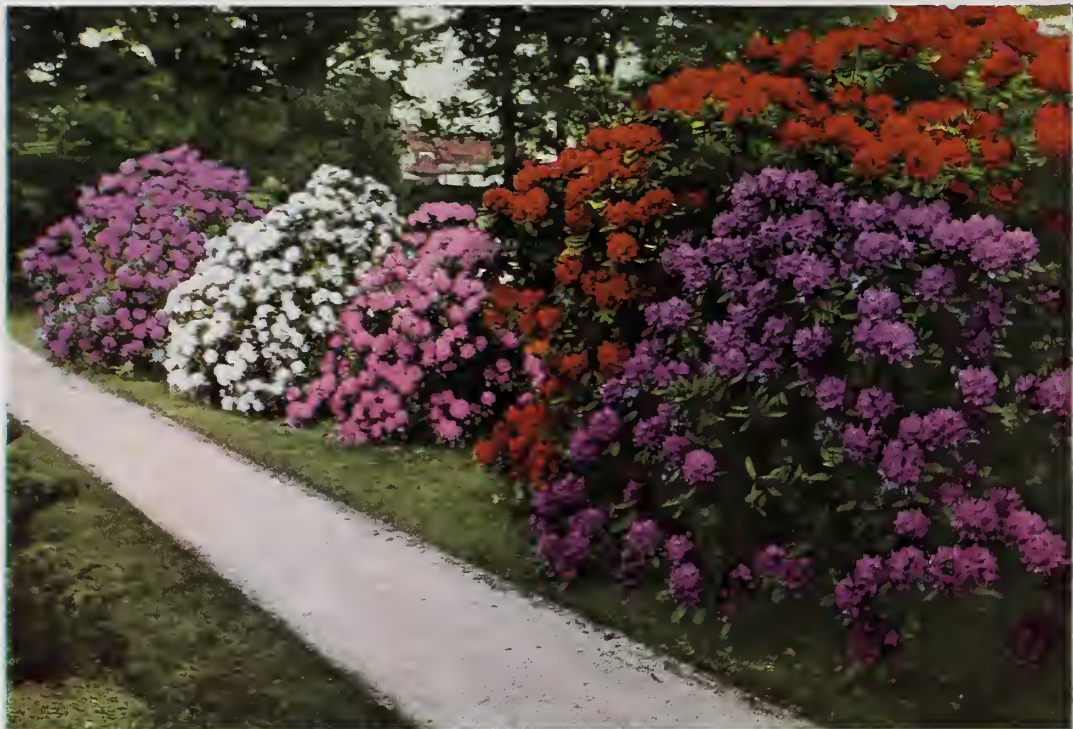
Mass Planting of Hybrid Rhododendrons See page 12