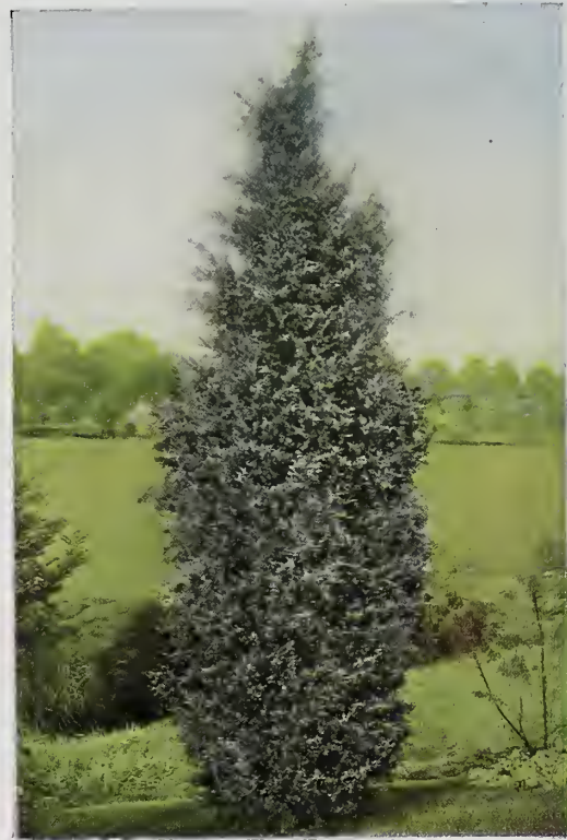
Juniperus glauca (Silvery Redcedar). See page 5

J. columnaris. Columnar Chinese Juniper. A distinct, narrow, columnar tree, with steel blue foliage which retains its color well into the Winter. Hardy and of rapid growth. Very formal.