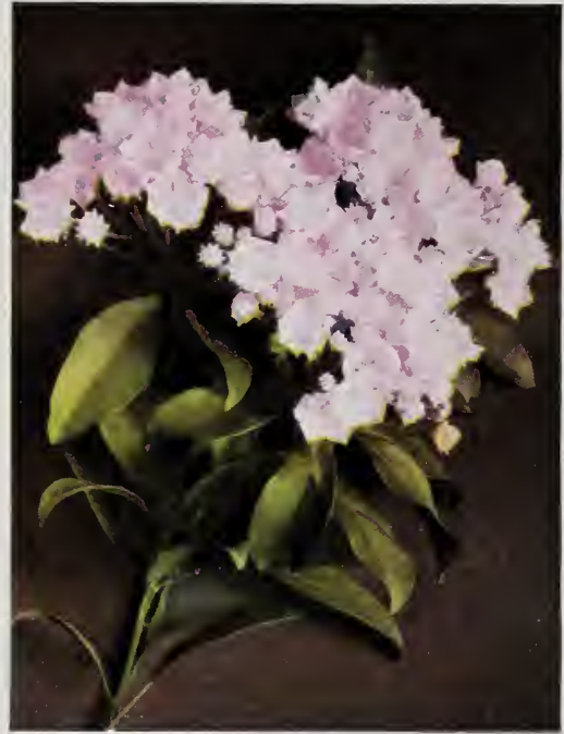
Kalmia latifolia (Mountain Laurel). See page 11

R. catawbiense. Catawba Rhododendron. A native variety, the parent of most of our best hybrids. Will grow in any soil that is free from lime; very hardy and free flowering, the large, round clusters of deep rosy purple appearing in May and June.