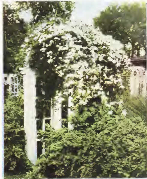
Clematis paniculata (Sweet Autumn Clematis)