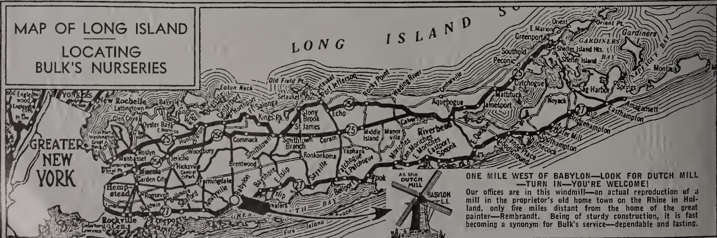
MAP OF LONG ISLAND LOCATING BULK'S NURSERIES