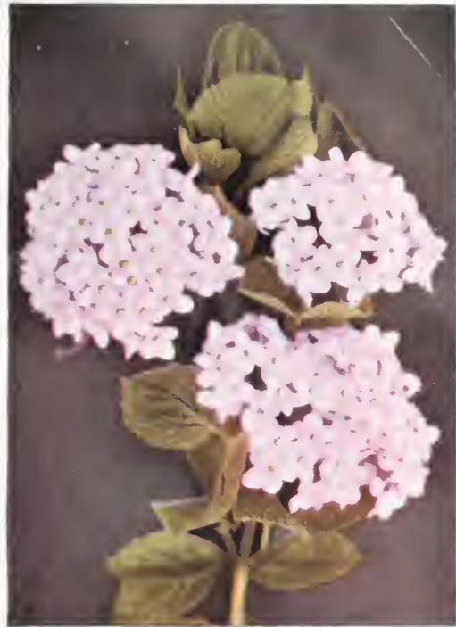
Viburnum carlesii ( Fragrant Viburnum ). See page 24