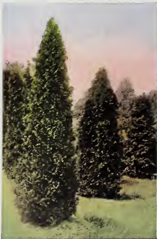
Thuja occidentalis (American Arborvitae)

T. globosa. American Globe Arborvitae. This small, dwarf evergreen is true to name, having a very round or globe-shaped outline. Very hardy, ornamental and most satisfactory for border planting or low growing hedges.