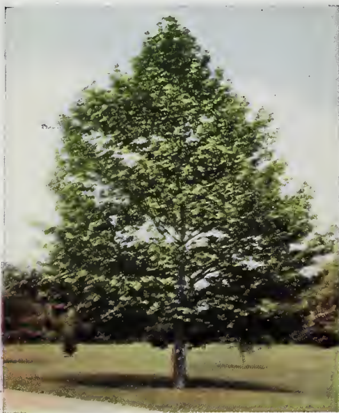
Platanus orientalis (Oriental Planetree). See page 17

FAGUS sylvatica riversi. Rivers Beech. A medium sized tree of pyramidal form, with bright purple foliage. Compact, symmetrical growth and a valuable lawn specimen.