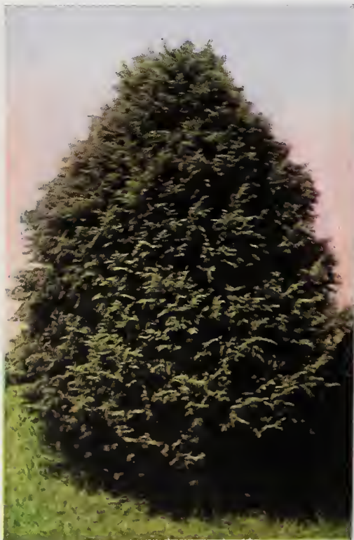
Chamaecyparis plumosa See page 3

IN this group are contained some of the most valued plants for landscape effects. The diversity of color and habit of growth in this class provides truly "a plant for every place and purpose," some for limited areas of foundation plantings or for bed and border uses, others for screens, hedges, windbreaks, and for group and specimen plantings. They are always desirable for any landscape plantings for both summer and winter effects.