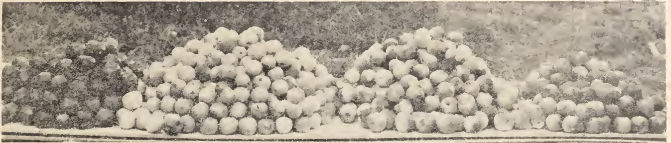
BLACKJON 97 per cent Extra Fancy 43 per cent "C" Grade COMMON JONATHAN 34 per cent Fancy 23 per cent Extra Fancy One season's crop harvested from the original parent Blackjon tree, showing color grades of all the fruit at picking time. The pile of dark apples at the extreme left is fruit from the one "sport" limb of Blackjon, which was all Extra Fancy for color—97 per cent. The three piles to the right represent common Jonathans from other portions of the tree which graded (reading from left to right) 43 per cent "C" Grade, 34 per cent Extra Fancy and 23 per cent Extra Fancy, for color.