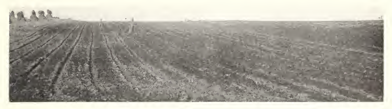
PEACH SEEDING-LARGE FIELDS OF PEACH SEED PLANTED EACH YEAR