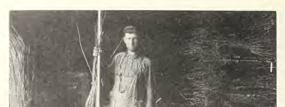
SIX-MONTH CHERRY-READY FOR PACKING. NOTE THE ROOT SYSTEM; ALSO THE HEIGHT. THE CAMERA TELLS ALL OF THE STORY, AND NO MORE. THESE CHERRY TREES ARE SIX MONTHS FROM BUD, WHOLE-ROOT PROCESS PEDIGREED TREES. PRO-DUCE WONDERS IN GROWTH.