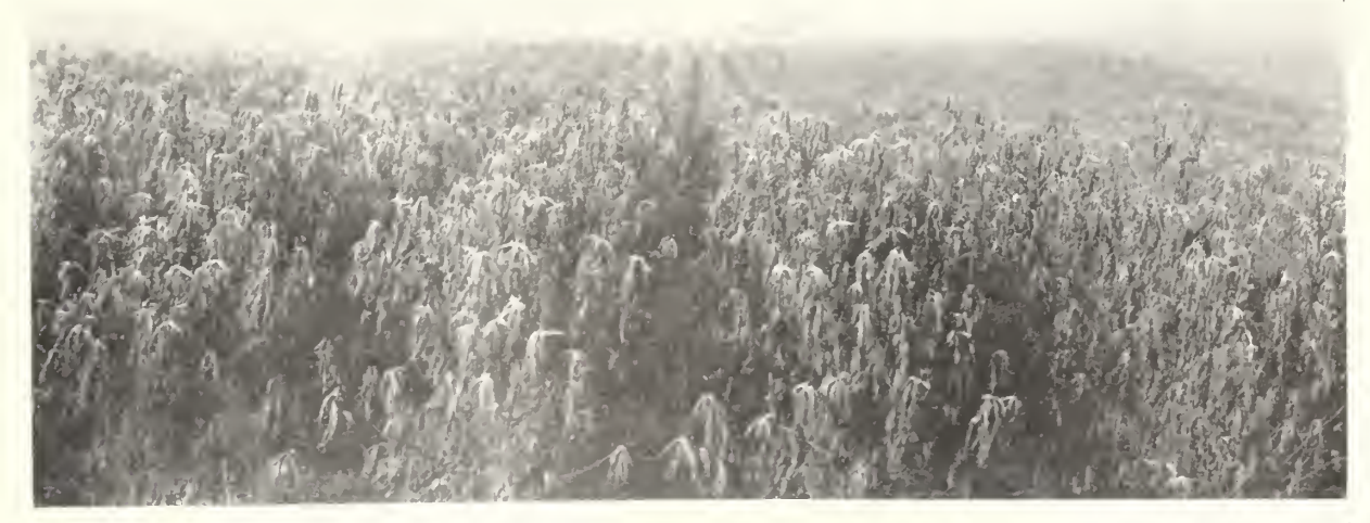
PEACH TREES, SIX MONTHS FROM BUD. NOTE THE GROWTH. THERE MUST BE AN UNSURPASSABLE ROOT SYSTEM OR THERE COULD NOT BE SUCH AMAZING GROWTH. THEY ARE PEDIGREED, WHOLE-ROOT PROCESS TREES

Season of Ripening. One hundred days after Mayflower and forty days Elberta. The latest of all. About same season as Krummel.