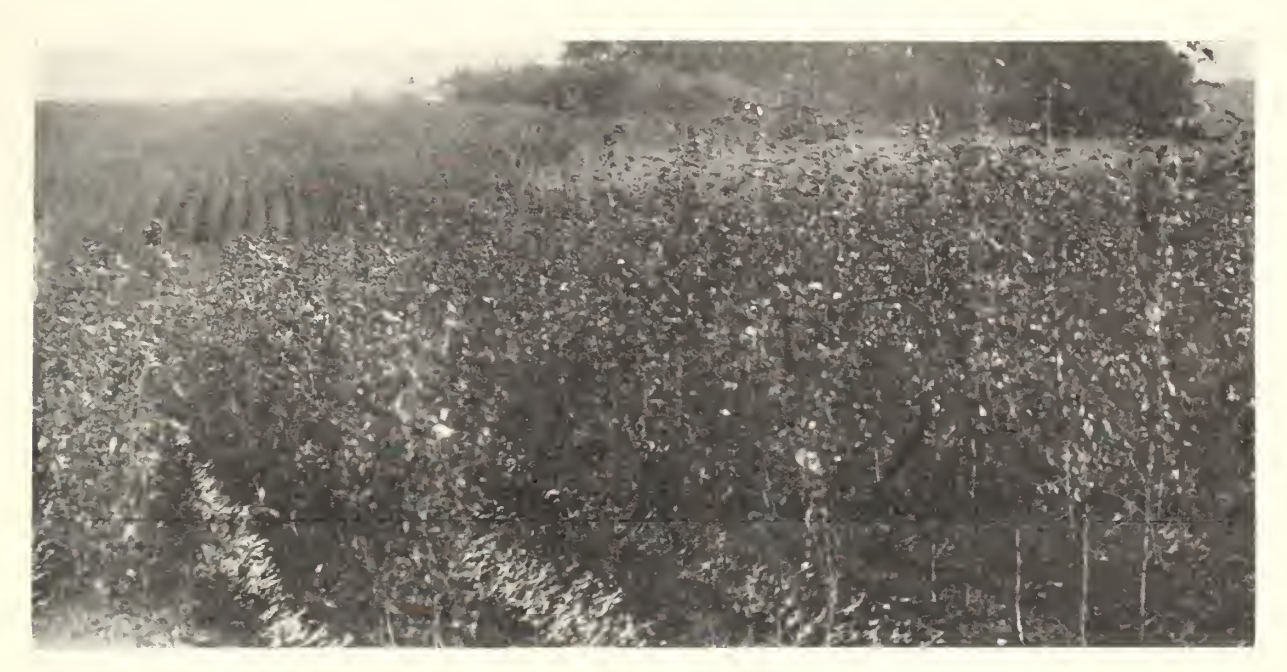
FIELD OF TWO-YEAR PEDIGREED, WHOLE-ROOT PROCESS, GOLDEN DELICIOUS