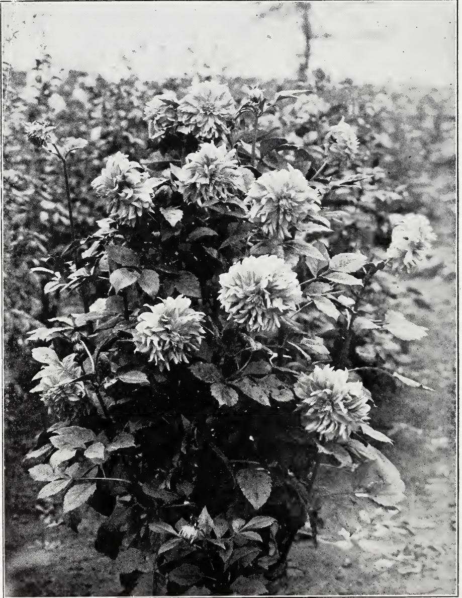
Bush of Heart of Gold

THE successful farmer rotates his crops. Many commercial Dahlia Growers do not, but grow Dahlias for many years on the same fields with excellent results. They rely on intelligent and thorough fertilizing, and continue to raise good Dahlias year after year. However, we believe, that the rotation of a legume crop will be found beneficial with Dahlias for at least two seasons out of six or seven. If this is not possible the maintenance of humus or decayed vegetable matter in the soil is next best.