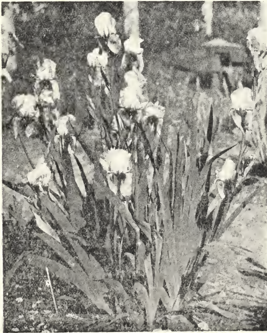
Iris Isoline - See page 8.

Rose, blue, pink, purple and white, including such varieties as Climax, White Climax, Lil. Fardell, S. T. Wright, Lutetia, $1.00 for fifteen