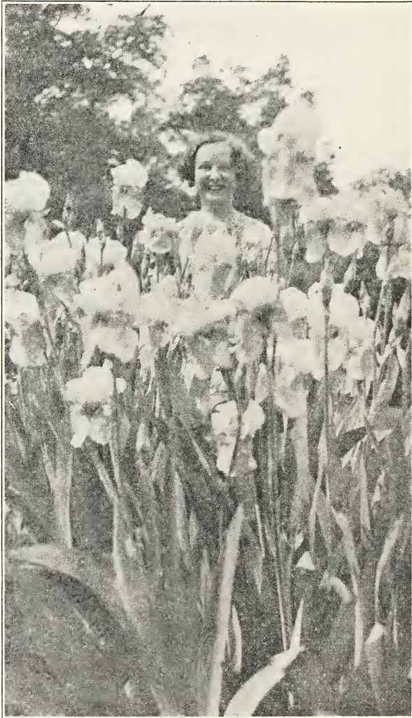
Ballerine blooming Spring 1931 in a Carolina garden Eleven year old lassie standing behind the flowers.