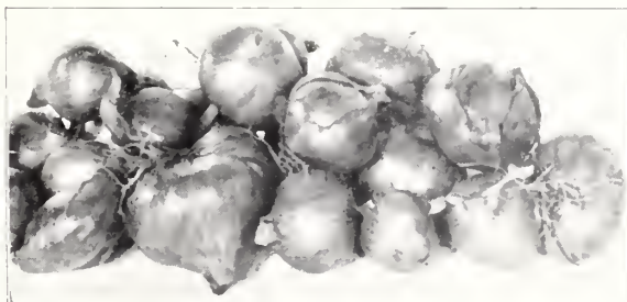
Strong, Vigorous, High Crown Bulbs.