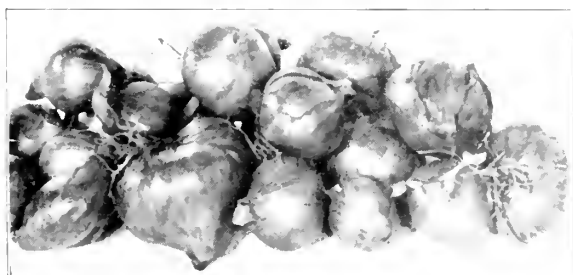
Strong, Vigorous, High Crown Bulbs.

Every box has full directions for planting . . . making it ideal for even the casual gardener. Our suggestion is that you concentrate on the packaged item . . . it makes less dirt, occupies less sales time and counter space, and brings in the lion's share of business.