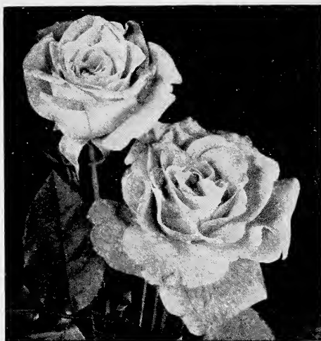
Talisman—A Delightful Newcomer