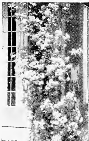
Climbing American Beauty