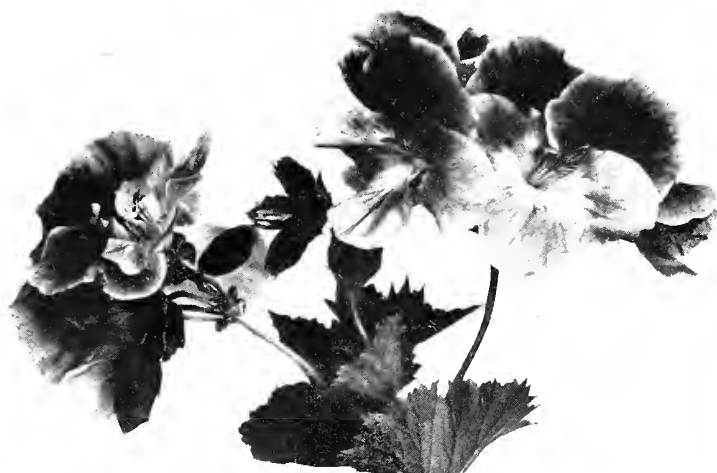
PRIDE OF QUEDLINBURG