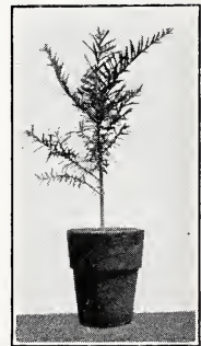
Taxus cuspidata upright 6 to 8 in. from pots