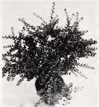
Cotoneaster Horizontalis 12-18"