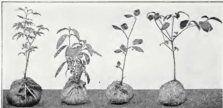
Jap. Bloodleaf Maple 12-18"