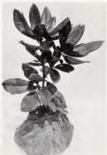
Seedling H. H. Rhododendron 12-15"