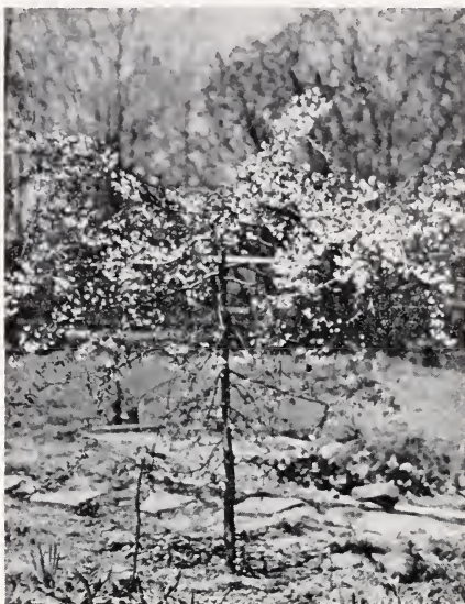
A Weeping Cherry Two Years After Planting a Kelsey Six-Foot Specimen

Yoshino Cherry —Single pink. Fast growth.