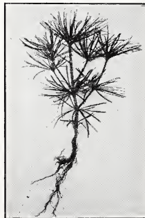
Sciadopitys 8 to 10 in. XX