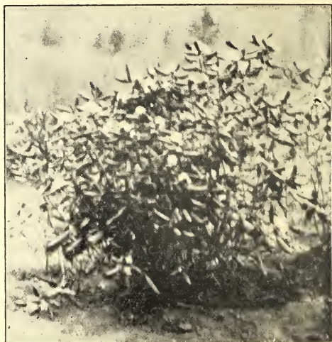
Rhododendron carolinianum, three to four feet clump.

KALMIA LATIFOLIA. Mountain Laurel, Calico Bush. Gives a fine effect, when interplanted with Rhododendrons. Does well in either sun or shade.