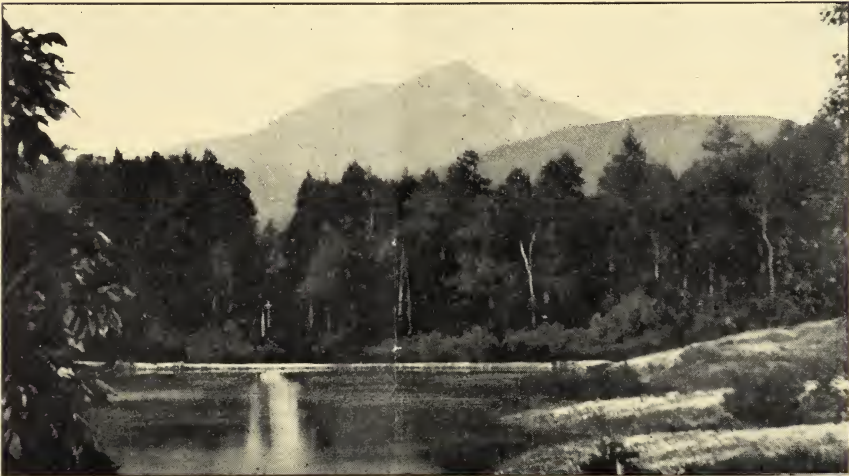
Grandfather Mountain. Elevation, 5,997 feet Included in the area owned by the Linville Improvement Company