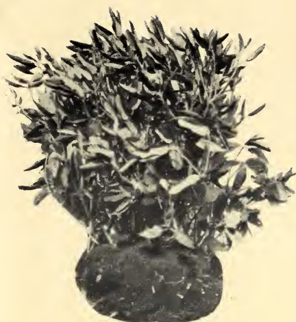
Rhododendron Catawbiense burnt over clump, three to four feet.