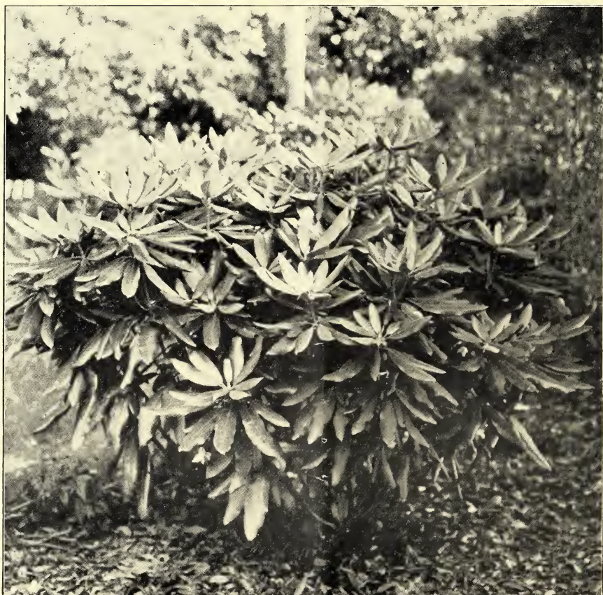
One of our four to five feet Rhododendron Maximum, burnt over clump, one year after being transplanted at Augusta Georgia.