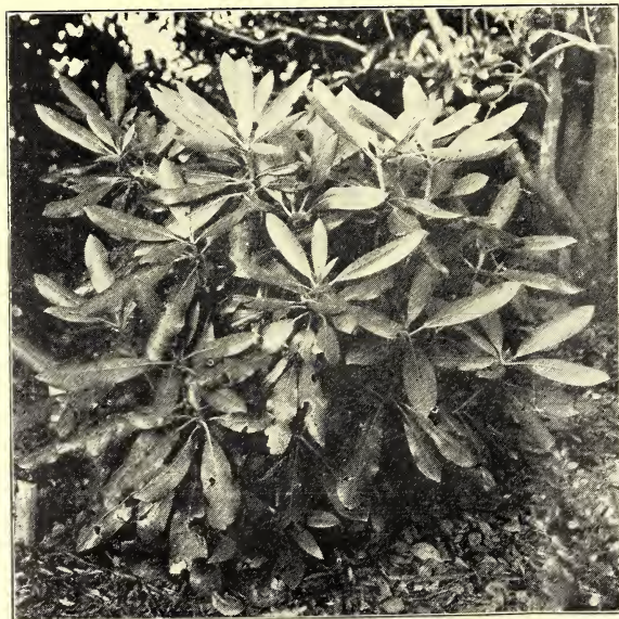
Rhododendron Maximum, burnt over clump, three to four feet.

Treat your plants according to these simple directions and they will afford you pleasure and blooms a plenty.