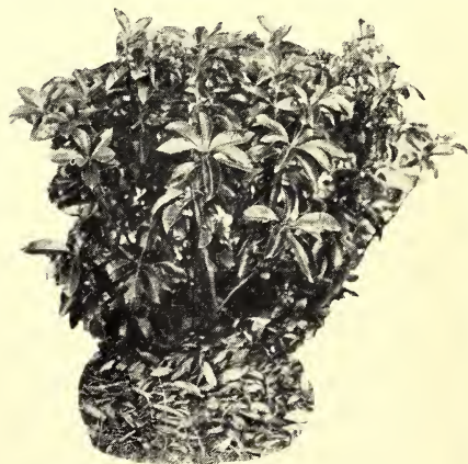
Kalmia latifolia, two to three feet burnt over clump.

Note: The three above varieties of Azaleas are vigorous plants with many young stems.