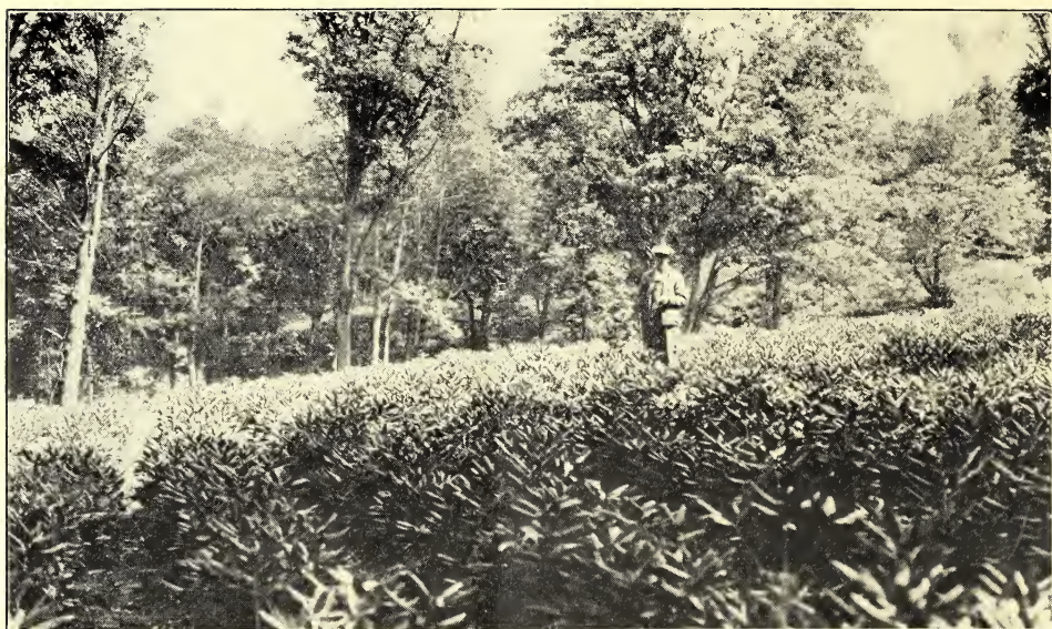
Block of Rhododendrons Catawbiense and Maximum in our nursery at Linville.