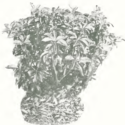
Kalmia Latifolia, two to three feet burnt over clump.

Note: The three above varieties of Azaleas are vigorous plants with many young stems.