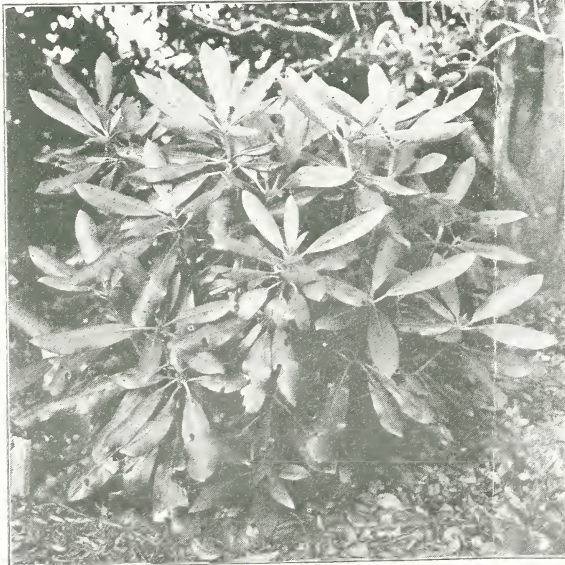
Rhododendron Maximum, burnt over clump, three to four feet.

Treat your plants according to these simple directions and they will afford you pleasure and blooms a plenty.