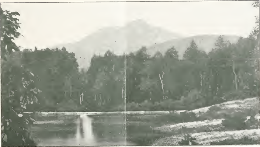
Grandfather Mountain. Elevation, 5,997 feet Included in the area owned by the Linville Improvement Company