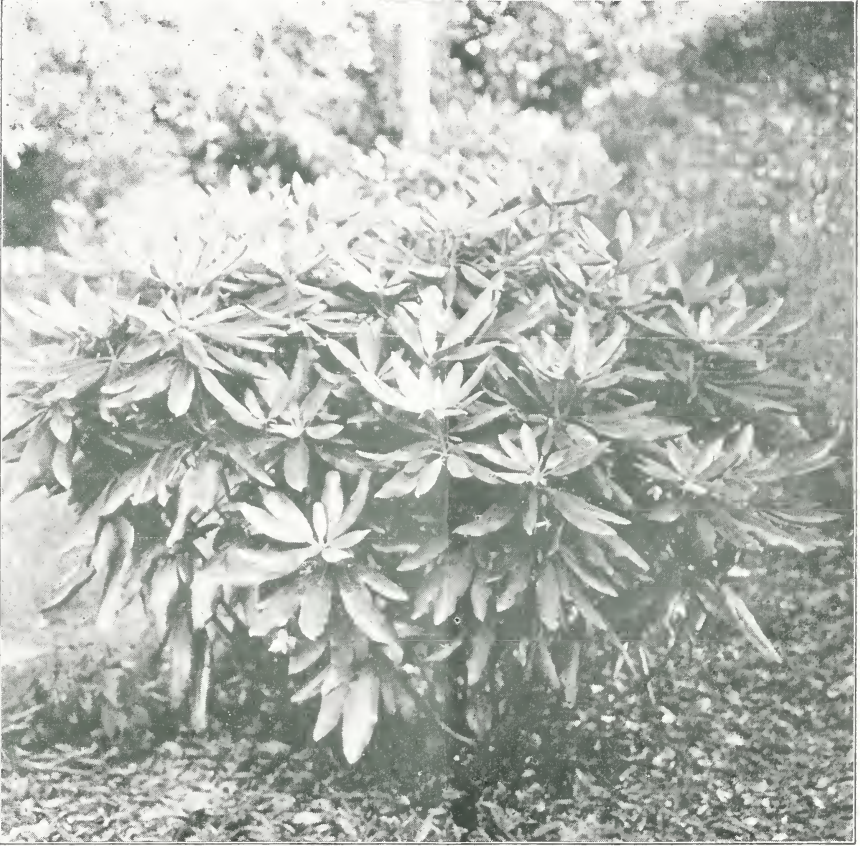
One of our four to five feet Rhododendron Maximum, burnt over clump, one year after being transplanted at Augusta, Georgia.