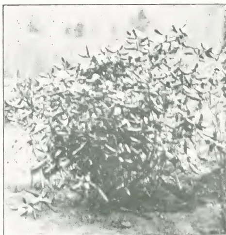
Rhododendron Carolinianum, three to four feet clump.

KALMIA LATIFOLIA. Mountain Laurel, Calico Bush. Gives a fine effect, when interplanted with Rhododendrons. Does well in either sun or shade.