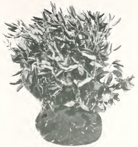
Rhododendron Catawbiense burnt over clump, three to four feet.