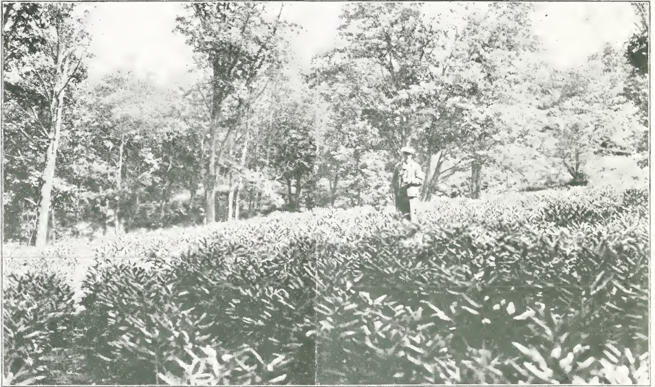
Block of Rhododendrons Chtawbiense and Maximum in our nursery at Linville.