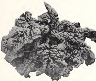
VIRGINIA BLIGHT RESISTANT SAVOY