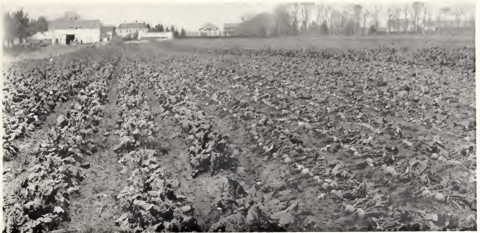
Headquarters Farm at Mattituck, Long Island, N. Y. Beets for stock seed breeding in foreground, buildings in background