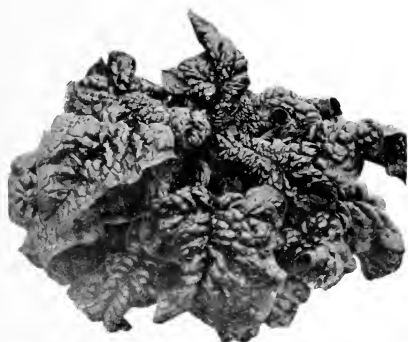
VIRGINIA BLIGHT RESISTANT SAVOY