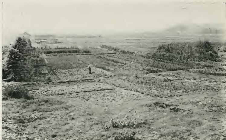
A Field of Young Ornamentals at Miethke's