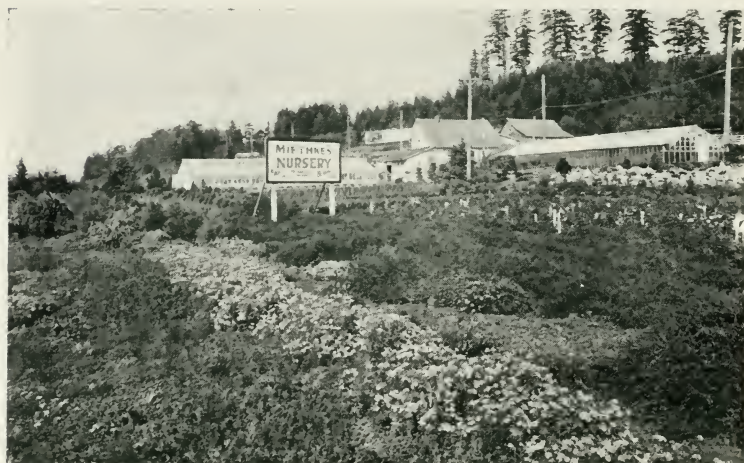
Rockery Plant Suggestions at Miethke's