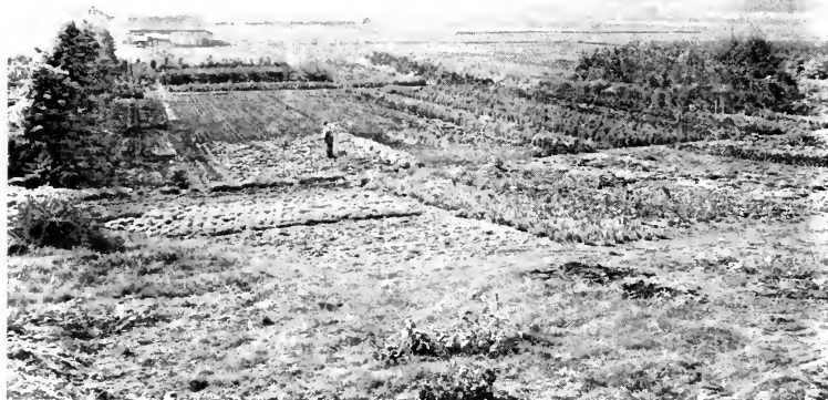
A Field of Young Ornamentals at Miethke's