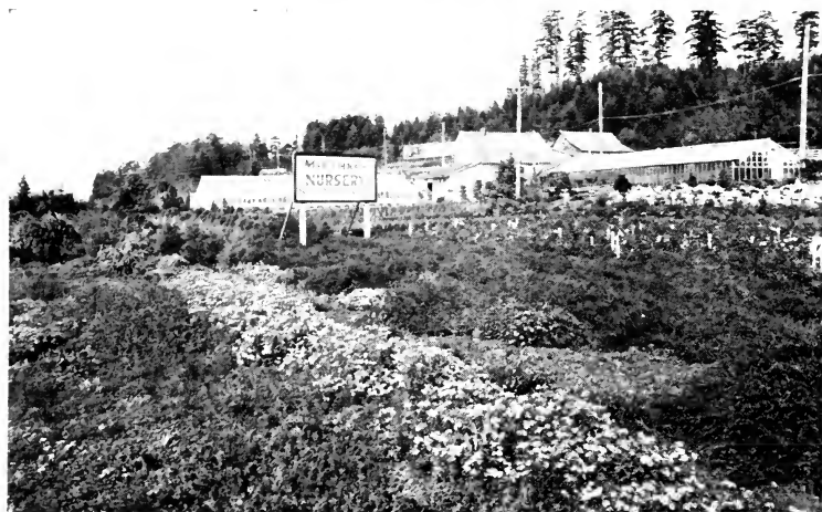
Rockery Plant Suggestions at Miethke's