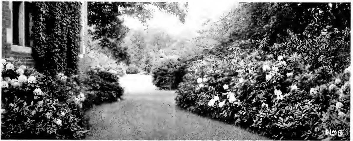
PLANTING OF RHODODENDRONS