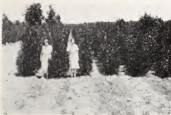
Biota Orientalis—Shapely Sheared Plants