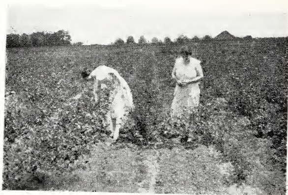
Fine Roses For Southern Gardens