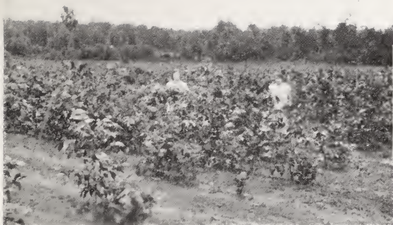
Pecans—One Year Bud—Good Growth