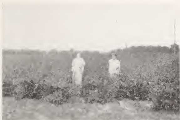
Sheared Abelia—Pargain Prices