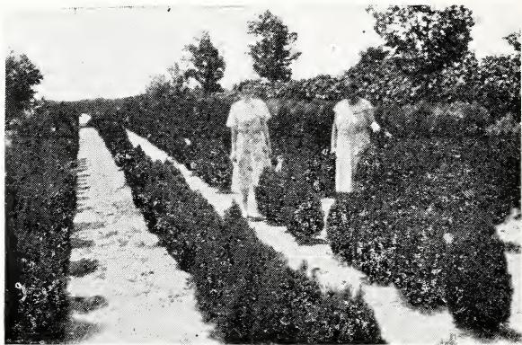
Biota Aurea nana—Compact—Uniform