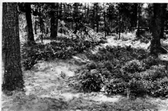
Azalea Beds—Natural Shade