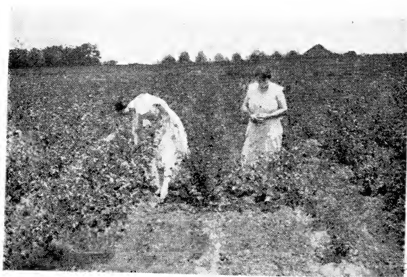
Fine Roses For Southern Gardens