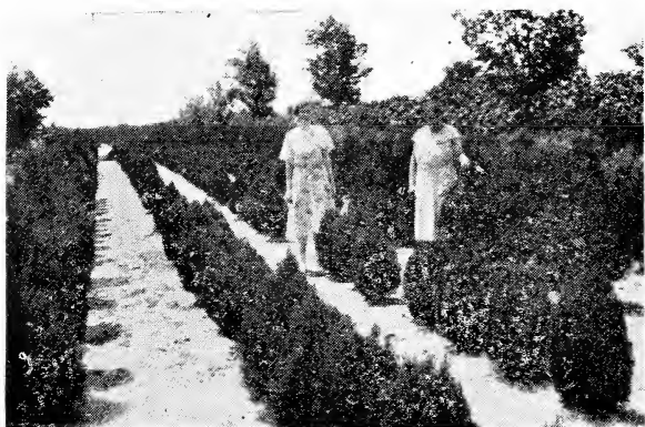
Biota Aurea nana—Compact—Uniform