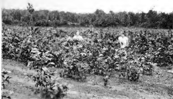
Pecans—One Year Bud—Good Growth