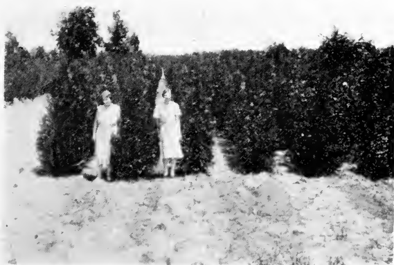
Biota Orientalis—Shapely Sheared Plants