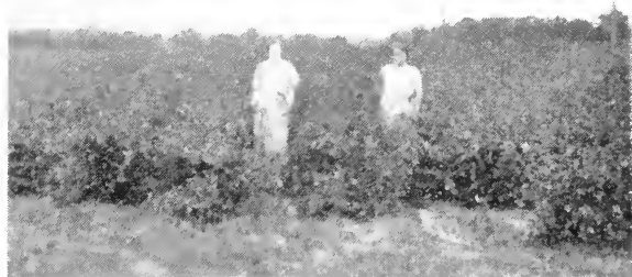
Sheared Abelia—Bargain Prices